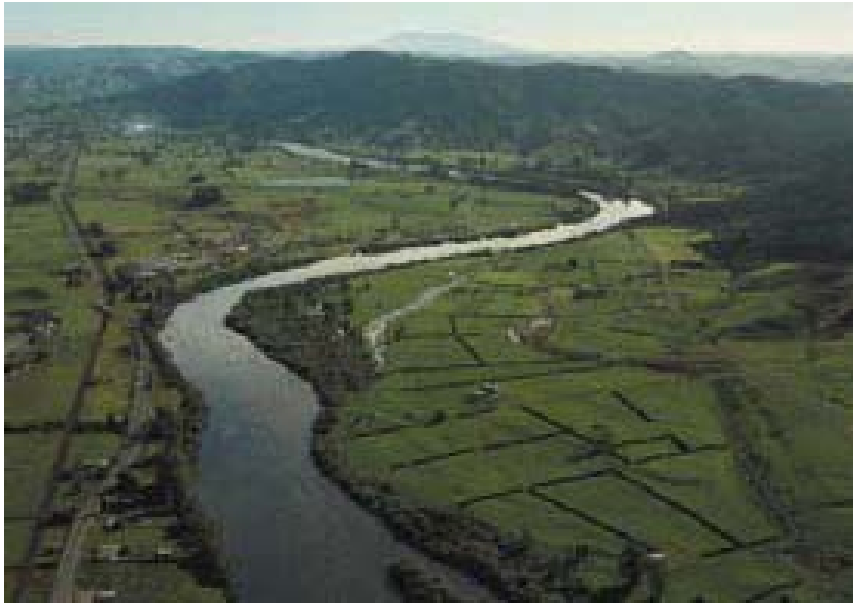
Figure 3.1: Taken from Geology of the Waikato Area , Edbrooke, 2005.

The Waikato River, flowing north past Taupiri (left foreground) from Ngaruawahia (left middle distance), has a less entrenched course across the Hinuera surface than further up river. Terraces immediately right of the river have a cover of Taupo Formation pumice alluvium. The Hakarimata Range on the right of the river forms the northwestern margin of the Hamilton lowlands. In the southwest, Karioi volcano is visible on the horizon (centre).