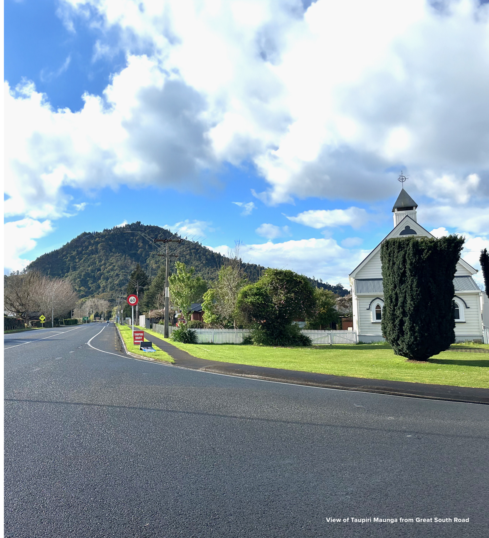
View of Taupiri Maunga from Great South Road

The following pages provide a summary of the opportunities identified through this process. Some of the opportunities sit outside of the remit of Waikato District Council, however were recorded to fully understand the issues and opportunities seen by the community. These opportunities have been assessed and considered by Council as part of this process and have informed the key moves and outcomes. Not all opportunities have been progressed.