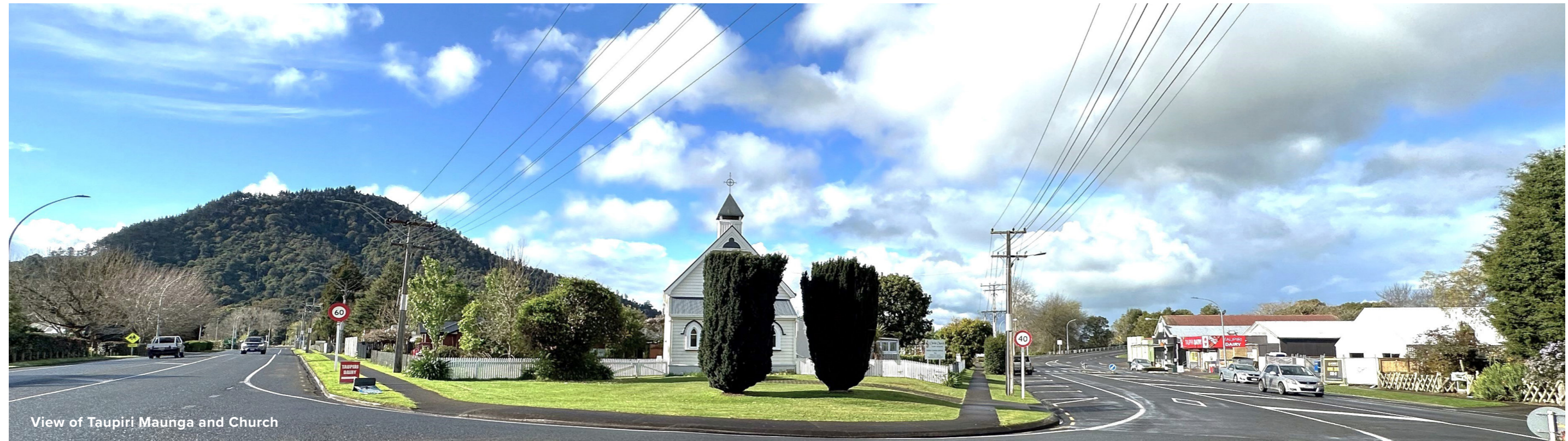
View of Taupiri Maunga and Church