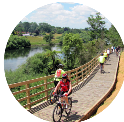
Te Awa River Ride extension