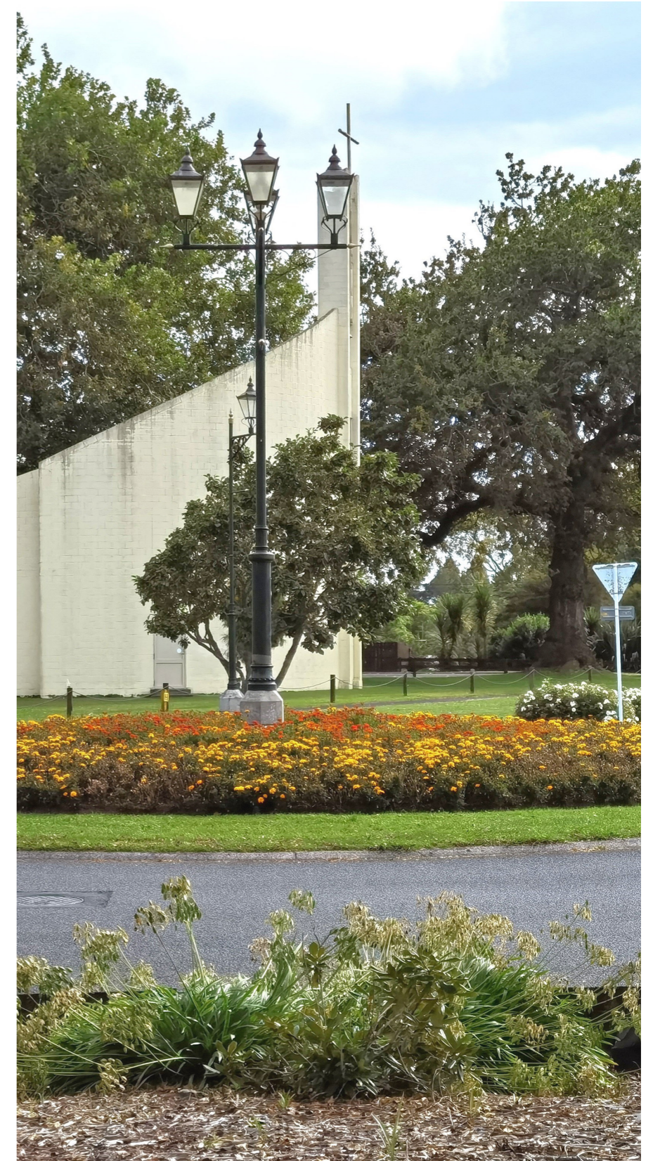
View of Holy Trinity Anglican Church in Ngaaruawaahia

Projects which relate to Climate Change Mitigation Actions include those that include improved resilience and will support reductions in Vehicle Kilometres Travelled (VKT).