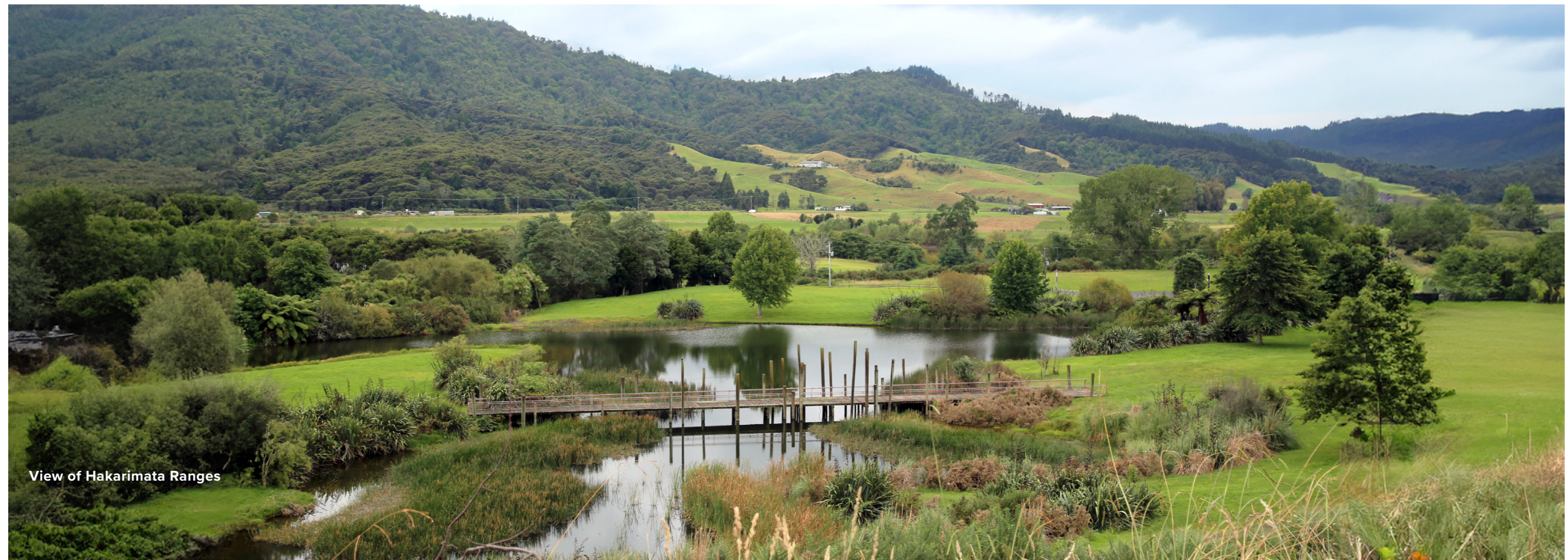
View of Hakarimata Ranges