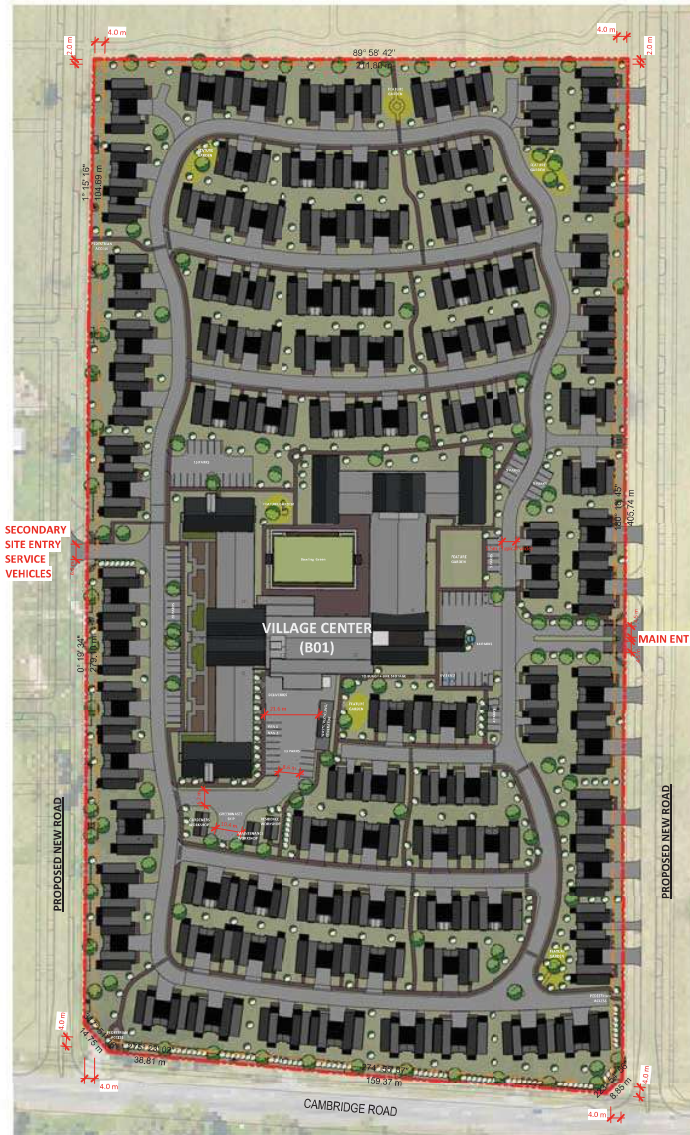
1 PROPOSED SITE PLAN All sheet scale = 1:1000