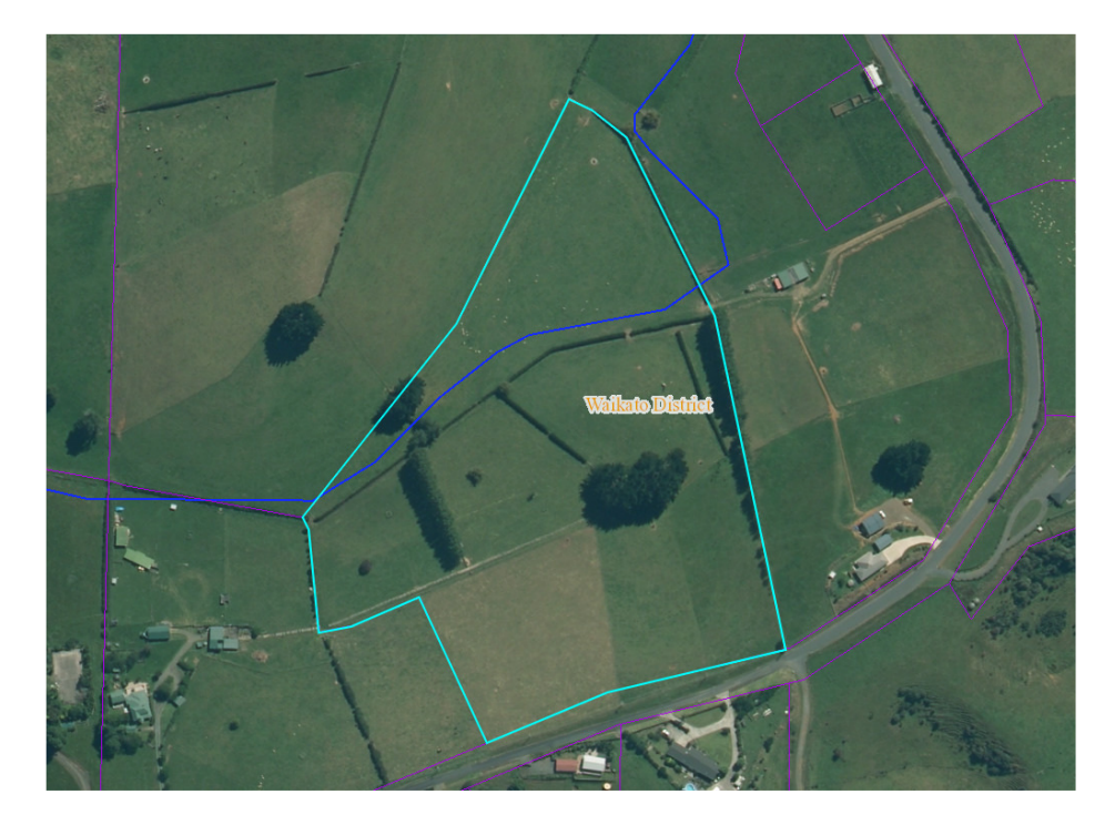
Figure 1: General location of stream relative to boundaries of Lot 2 DP 202306 and the Notified PWDP Village Zone extents.

boundary follows the parcel boundary of Lot 2 DP 202306. The stream runs alongside and through this site as demonstrated in Figure 1.