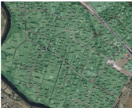
Figure 1 – Established Country Living Zones – Lake Rotokauri (left) | Tamahere, Hamilton (right)

4. The Country Living Zone has a minimum lot size of 5,000m<sup>2</sup> – which means subject to topography, market demand, and lifestyle preference, they will be on average larger than that. The image on the left in Figure 1 above is an established Country Living Zone on the southern side of Lake Rotokauri, northwest of Hamilton. The image on the right is the Newell Road area in Tamahere, southeast of Hamilton. Neither of these locations can be readily transitioned to urban densities of 1:450m<sup>2</sup> as the reporting planner envisages for Vineyard Road.