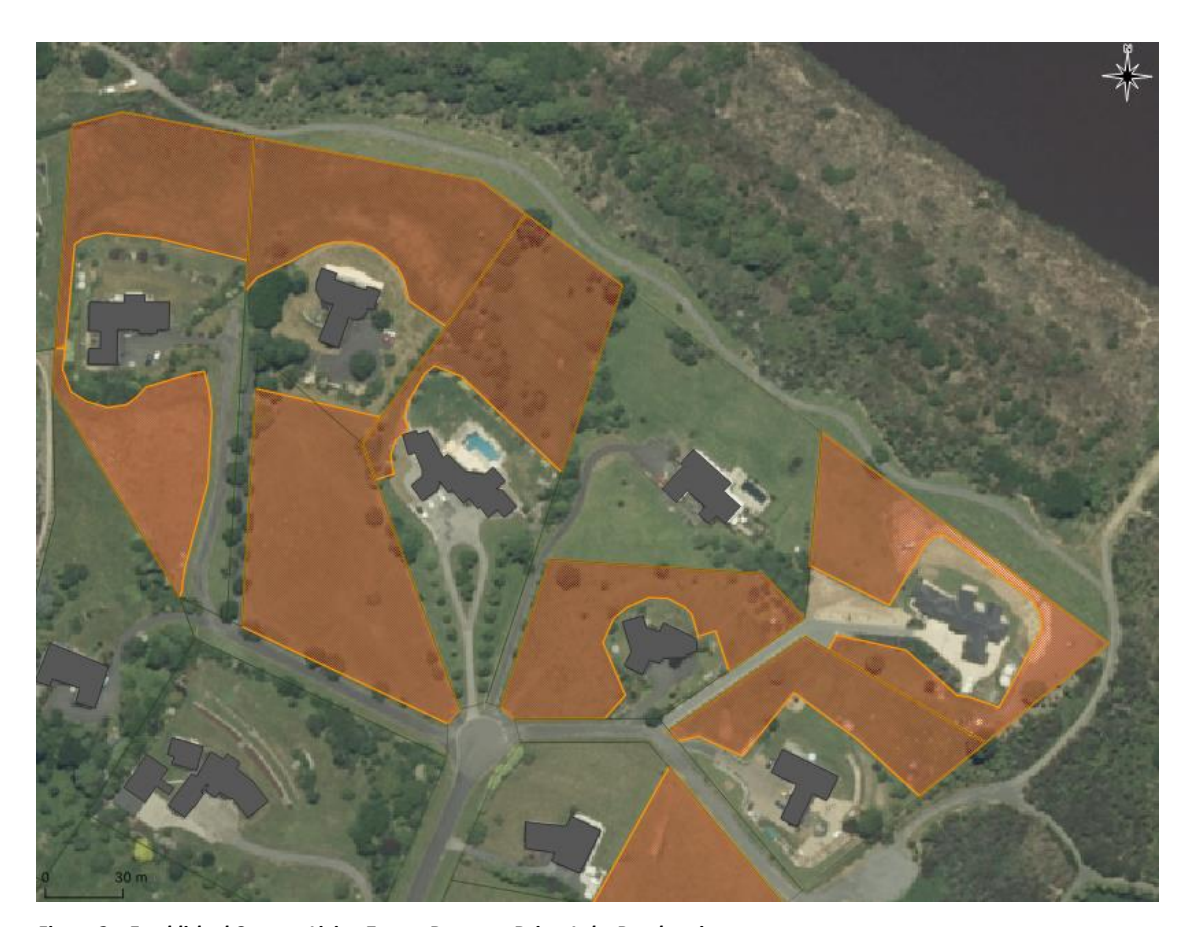
Figure 2 – Established Country Living Zone – Dromara Drive, Lake Rotokauri

5. Figure 2 below illustrates why the Country Living Zone is a 'final form' of development. The owners of these Dromara Drive properties (at Lake Rotokauri) have invested a significant amount of capital to optimise their sites for their individual needs. The dwellings in this zone are large. None of the existing dwelling footprints would comfortably (let alone compliantly) fit on a 450m² urban allotment. They most certainly would not retain the privacy, amenity, and outlook they presently enjoy, even if were they to be fortuitously rezoned Residential.