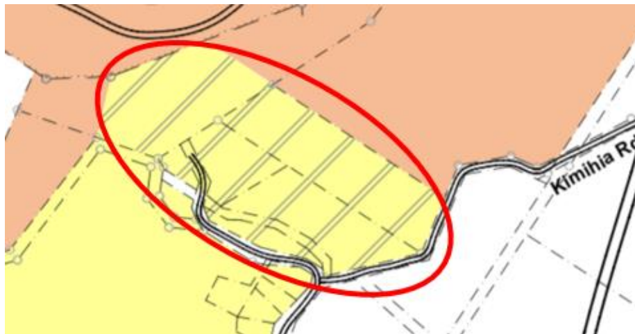
Figure 2 - Sheet A01-04 from October 2018 submission