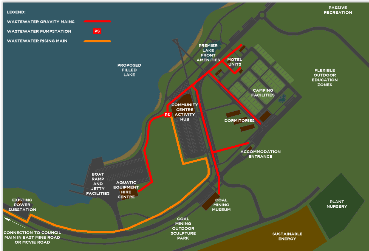
Figure 6: Diagrammatic representation of the proposed wastewater reticulation might fit within the site.

As per the table above, a portion of run-off is to be sent to green facilities if possible. A review of available geological information has been carried out, and confirmed that the site soils can generally be characterised as soil types five or six (as per AS/NZS1547-2012), which informs the conceptual dripper field sizing carried out. Detailed site investigations and specific design must be undertaken at a later date.