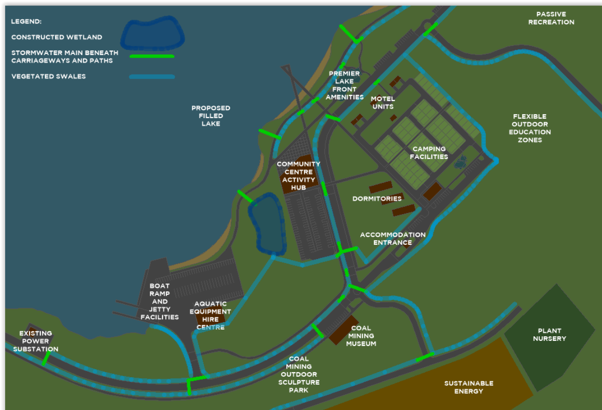
Figure 5: Diagrammatic representation of how a hybrid “treatment train” option might be located within the site.

The use of both swales and a centralised wetland would provide a further improved quality of stormwater discharge and lessen the initial investment in underground infrastructure. Runoff from hardstand areas would be conveyed to the wetland in open swales, where a degree of initial treatment would occur. The wetland itself could be reduced in size from that used in the option above, but the ongoing maintenance of this option would be the most demanding of the three options presented here. It is understood that the site is to remain in private ownership, and therefore the ongoing maintenance of the infrastructure would remain the obligation of the landowner. The figure below indicates how this system might fit conceptually within the site.