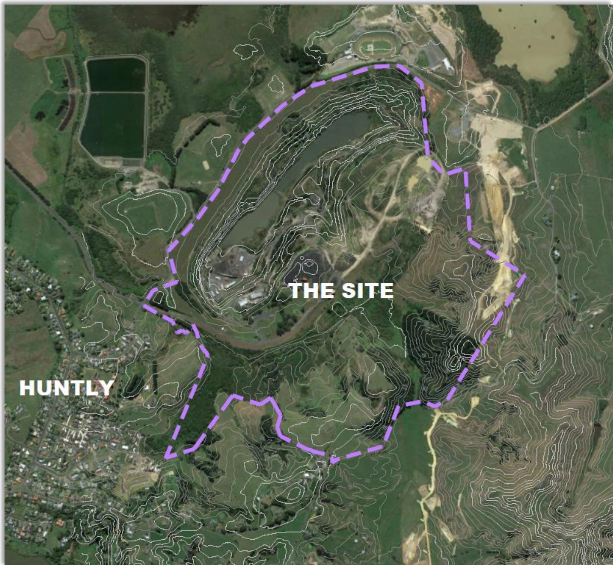
Figure 1: Existing site boundaries, contours and aerial.