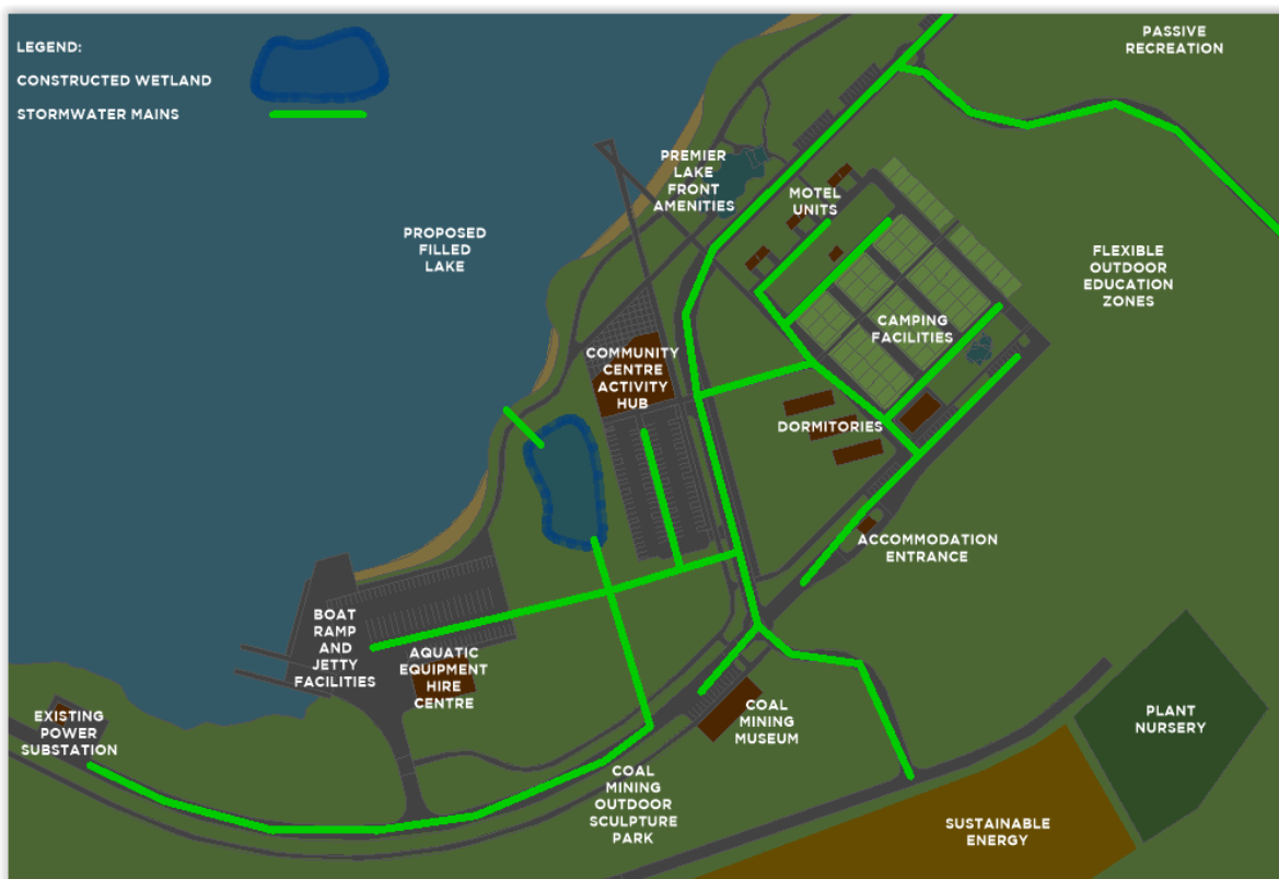
Figure 4: Diagrammatic representation of how a centralized constructed wetland might be located within the site.