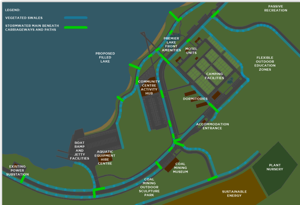
Figure 3: Diagrammatic representation of how vegetated swales might be located within the site.

collect and treat runoff from all hardstand areas, in a manner similar to that shown in the figure below. This method would require little in the way of traditional piped infrastructure, but would require an increased investment in ongoing maintenance (silt removal, weeding, general landscaping).