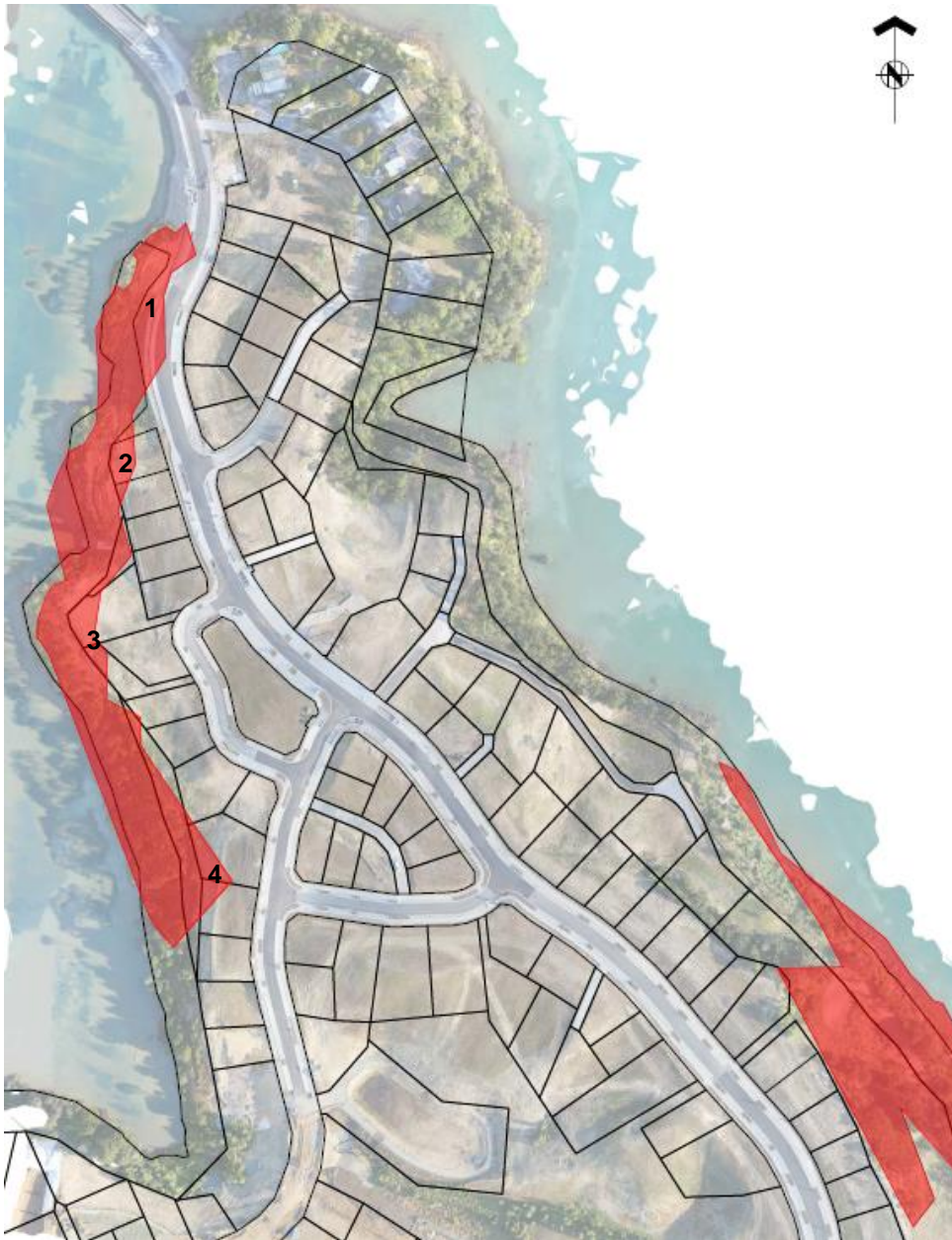
Precinct A Subdivision Boundaries with PWDP Significant Natural Area overlay and Recent Aerial Photograph (January 2020).

Refer to pages which follow for more detailed diagrams of Areas 1-4.