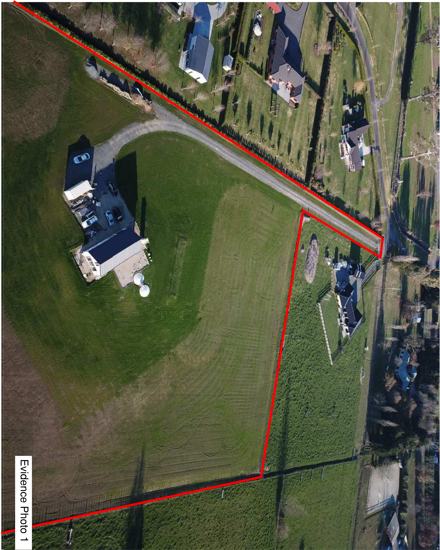
Evidence Photo 1