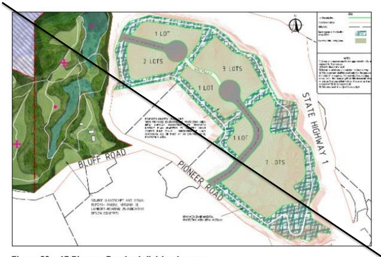
Figure 23 – 67 Pioneer Road subdivision layout