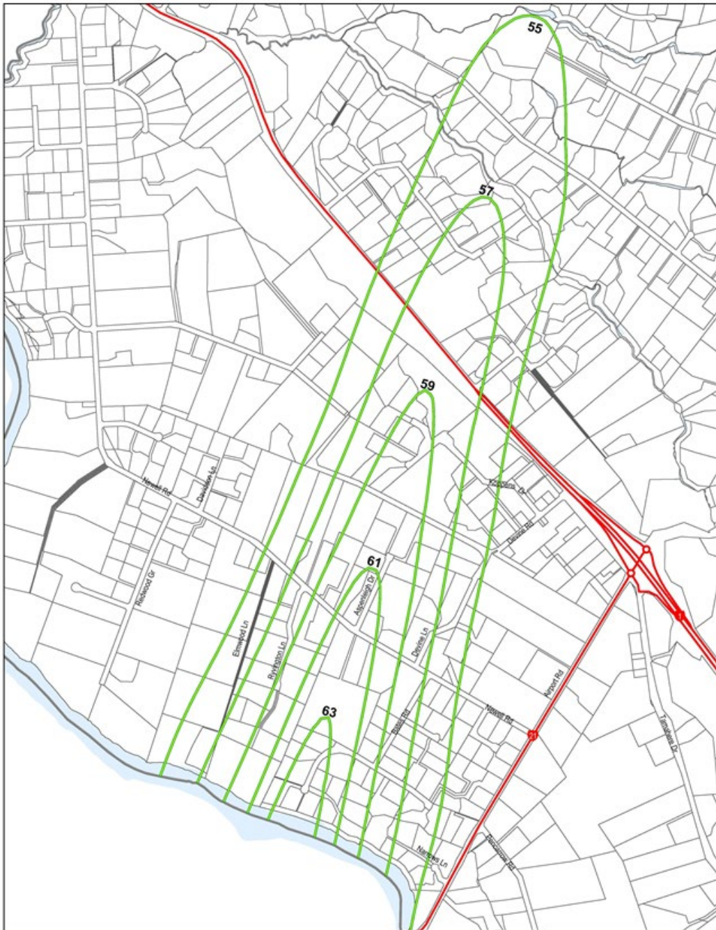
Figure 30 – Hamilton Airport, L dn Contours for Sound Insulation Design

The Hamilton Airport, L dn Contours for Sound Insulation Design in Figure 30 below illustrates the L dn contours within the Airport Noise Outer Control Boundary (as shown on the planning maps) in two decibel increments. It is provided to calculate internal noise levels in accordance with the standards for permitted activities.