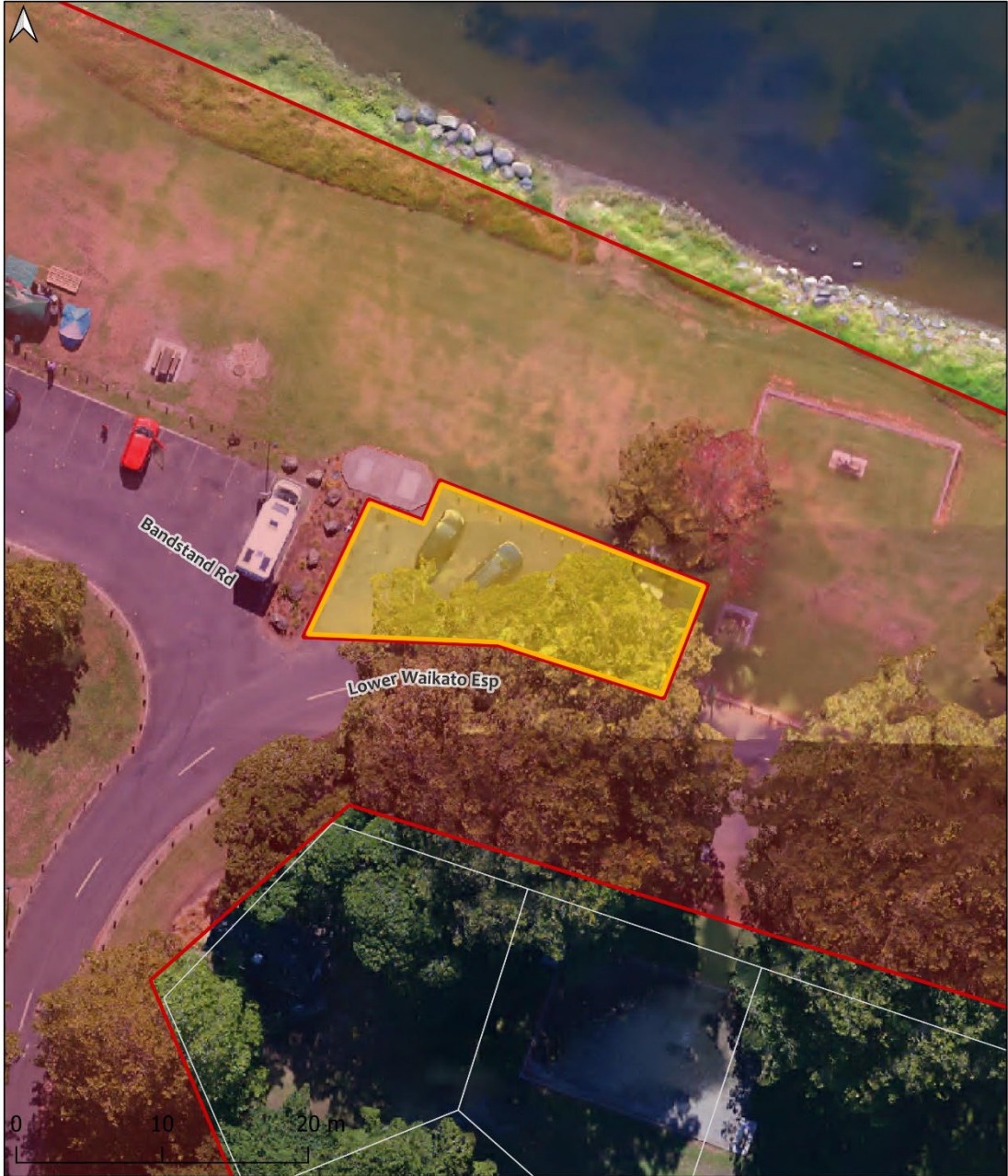
Freedom Camping Bylaw