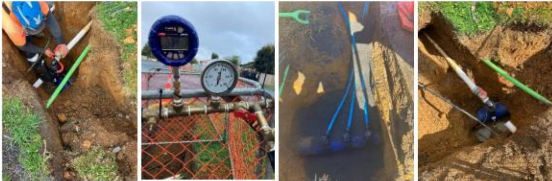
Elizabeth Street, Tuakau – Watermain Renewal

The 2024/27 Water Supply Renewals Programme is planned to start in September.