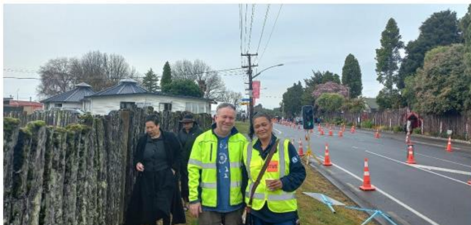
River Road – Early Traffic Management Coordination Meeting

During the Koroneihana, the diversion was reduced to a compact arrangement, and coordination workshops were held with the STMS ahead of the annual event.