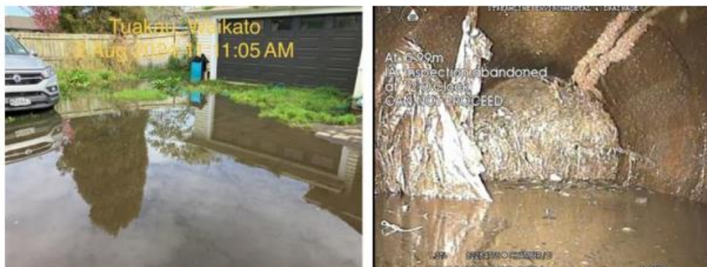
Above image showing the extent of the surface flooding – Tuakau Image above showing the root mass which was removed

A blocked Storm Water line, which passes under the railroad in Tuakau, occurred in early August. CCTV investigation determined severe root intrusion was the cause. Fortunately, the root mass could be removed without accessing the rail corridor, so it was relatively quickly resolved.