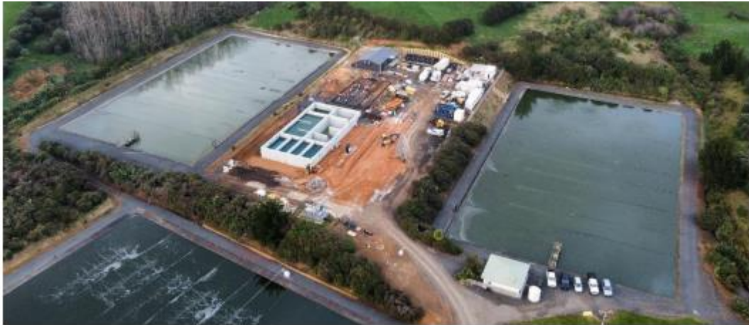
Raglan WWTP MBR Upgrade- The reactor tank and new plant building

Site drainage is being installed and the inletworks platform will follow. Additionally, the building fit-out is well underway and the mechanical pipework and control panel fabrication continues.