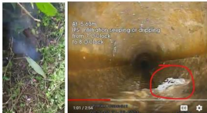
The above images show smoke identification of faults and CCTV footage

Smoke detection was done on a Wastewater line at Point St, Raglan. Watercare had identified elevated flows in rainy conditions at the nearby pump station, and CCTV identified two faults causing the issue. Both issues were rectified by patching