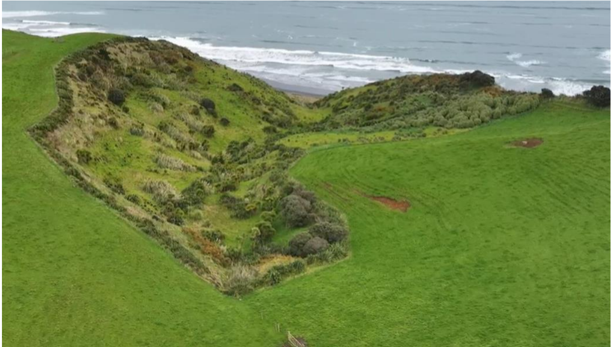
Figure 1: Drone photo of Western Gully on Wainui Reserve

Once the MBR plant is operational, the existing pond systems will remain active for emergency storage in severe weather events. The current harbour discharge system will still be needed in the short to medium term for contingency purposes, should the storage ponds become full during severe weather and additional flows cannot be sent to the gully. Our ultimate goal is to cease harbour discharge, but we first must carefully test and monitor the performance of both the MBR plant and the new discharge method.