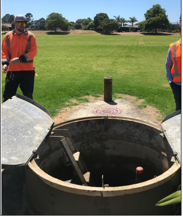
Images 3 and 4: Pauanui SDI methodology to be replicated with any Raglan land discharge solution