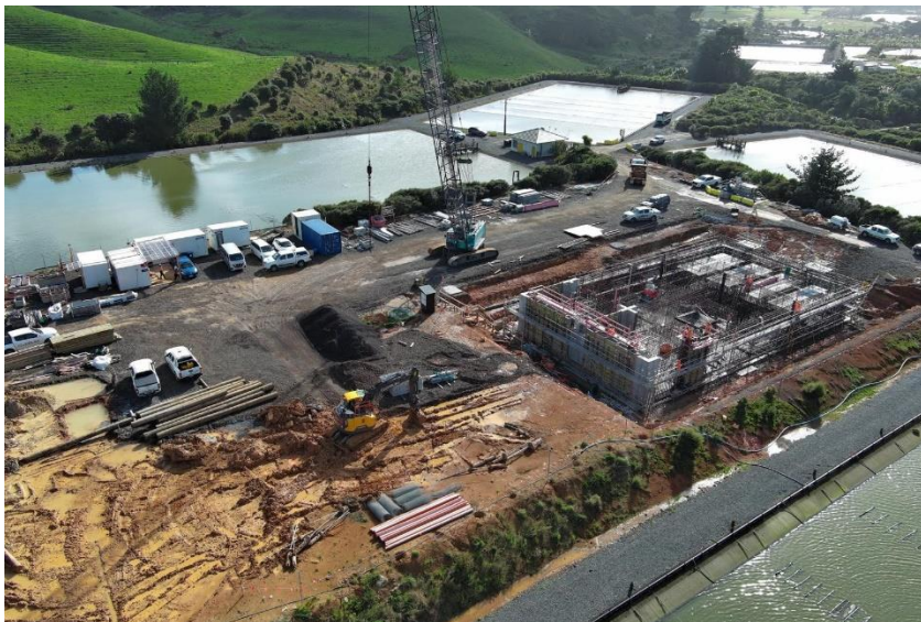
Raglan WWTP MBR Upgrade– The reactor tank foundation is complete and the wall installation is underway.