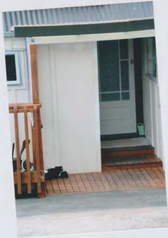
06/02/2021. Knuden at Snypts door