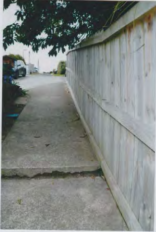
Snyppals house, my house, my garage, the shared driveway + public walkway 06/02/2021