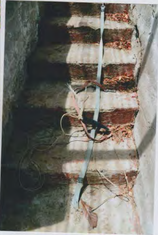
My current fencing, + the long least for Casper, 06/02/2021