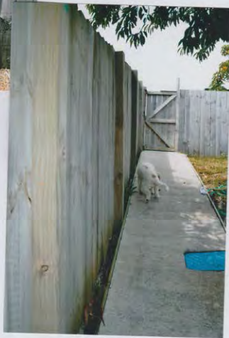
My current fencing, + the long leash for Casper, 06/02/2021