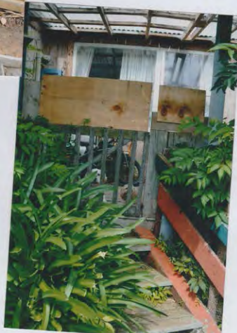
Side gate 77 Wallis St. 06/02/2021