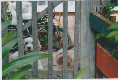
Side gate 77 Wallis St. 06/02/2021