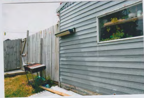
My current fencing, + the long leash for Casper, 08/02/2021