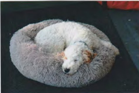
Casper. Photos taken in 2020