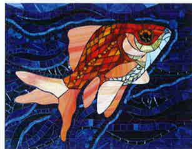
Term two 2016 Mosaics class