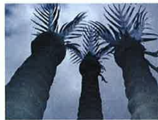
Darjit sculpture workshop Term 2 2016