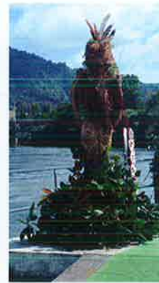
Earth forms Term two 2016 workshop