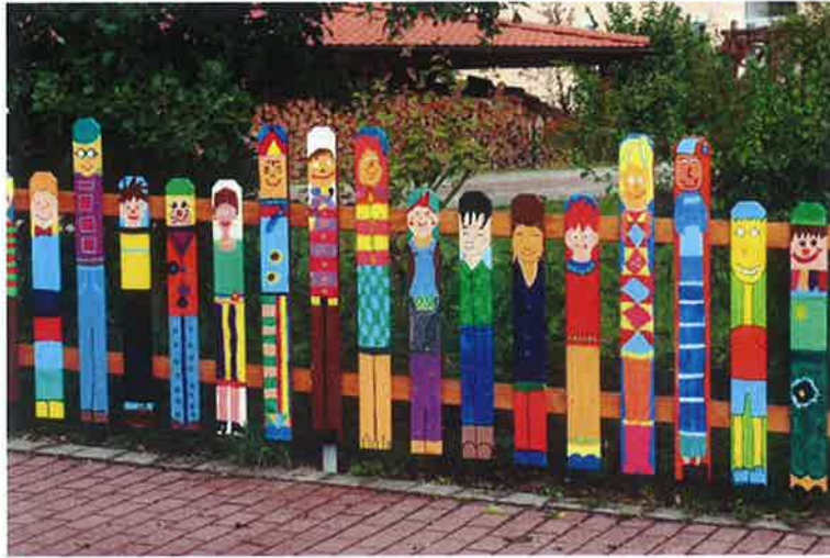
Term one 2016 School holiday programme community sculpture