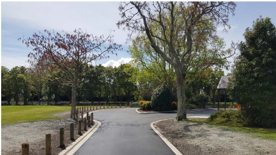
Completed Ngaruawahia Cemetery access road turning head

18/153 – Ngaruawahia Cemetery Access Road Upgrade is now complete and the cemetery is open to the public.