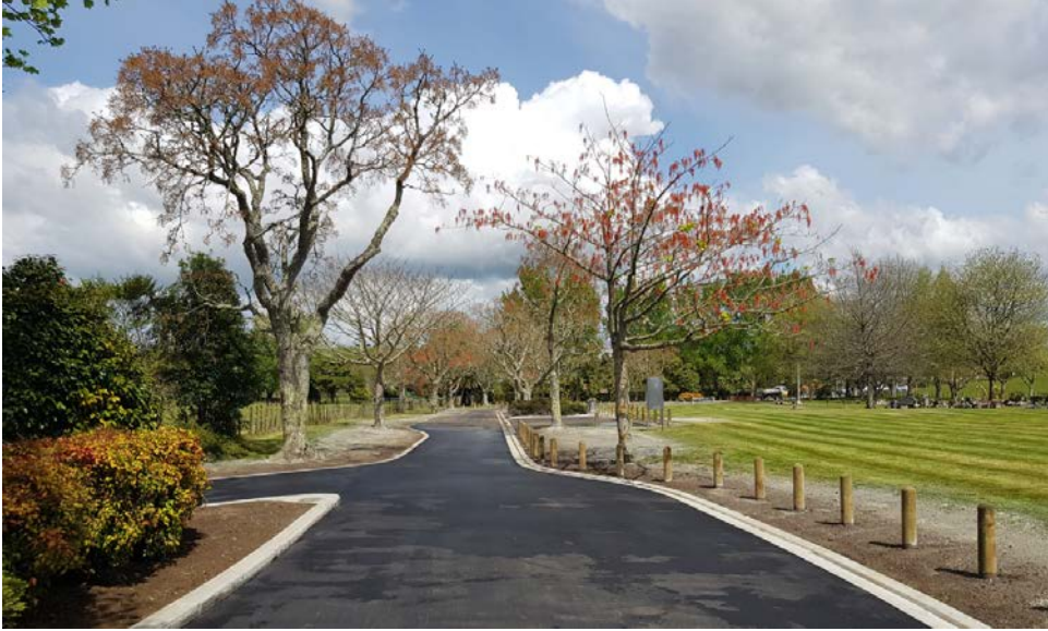
Completed Ngaruawahia Cemetery access road from turning head looking back toward entrance