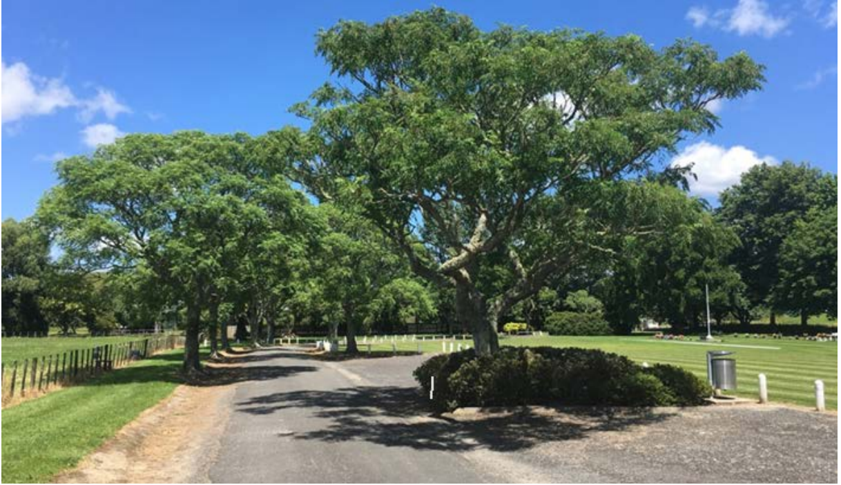
Jackson Street Cemetery Access