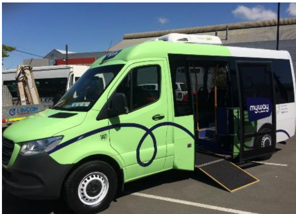
GBV Constructed Small Bus

Smaller vehicles typically suit this mode of operation. These are available at slightly lower cost than full size buses and are more cost effective to operate, however the trade-off is reduced seating capacity. Some examples are shown below.