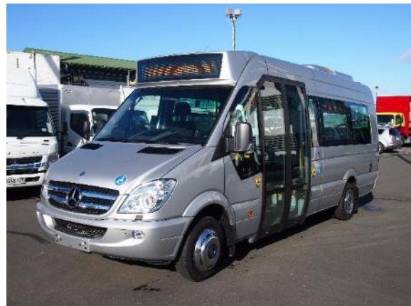
Mercedes C45 Sprinter

Waikato Regional Council will work with Waikato District Council to develop the case for and secure funding for a Demand Responsive bus service in the north Waikato area.