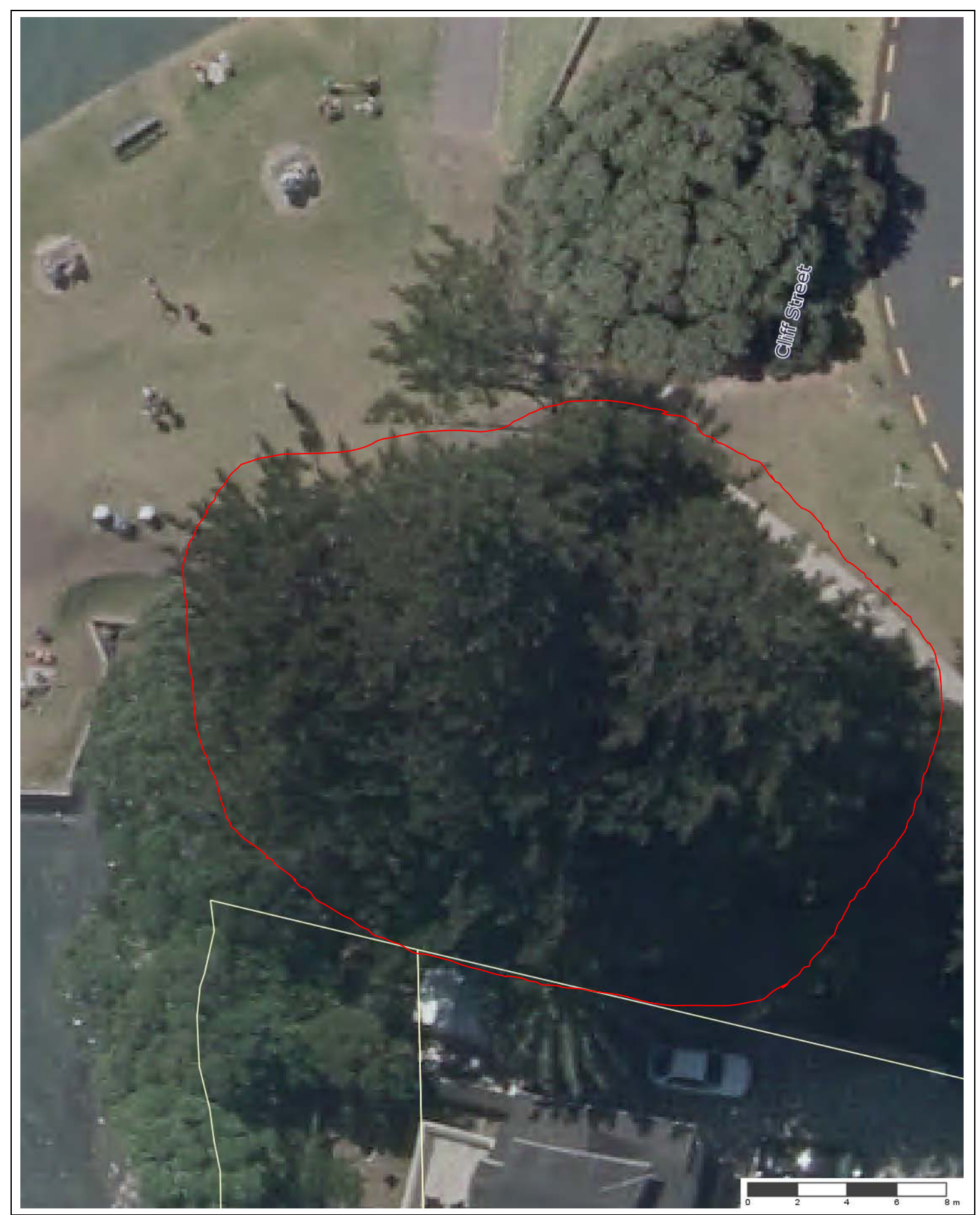
Group of four (4) notable Norfolk Island pine trees. Harbour end of Bow Street, Raglan.