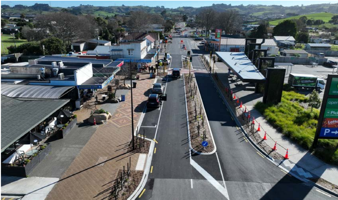
Street looking north

Upgrades to the road and footpath between Market Street and Wellington Street are almost complete with just the planters and street furniture to be installed. All works due to finish July 2024.