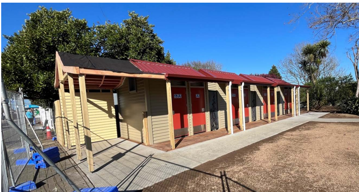
Construction well underway.

Site works now well underway. Toilet blocks are in place and being connected. Aiming to complete project by mid-July.