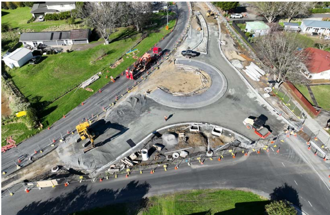
Roundabout site looking south

The pavement sub-base is now being build up. We'll be expanding our worksite footprint for the next 3-4 weeks to construct the first part of new kerb and channel. This will cover the entrance into Church Street and the front of sections between the roundabout site and police station.