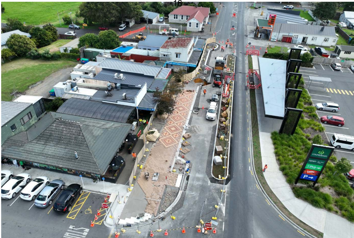
Main Street looking north