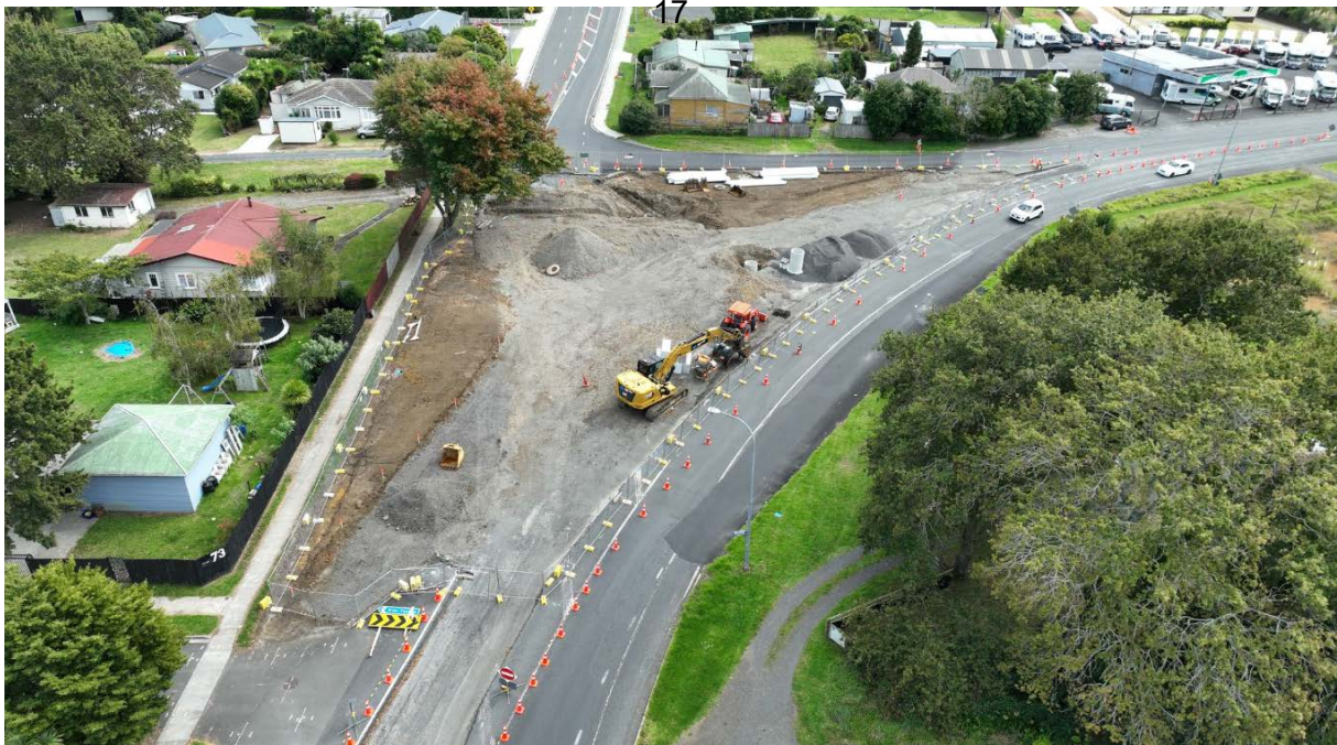
Great South Rd / Pokeno Intersection looking north