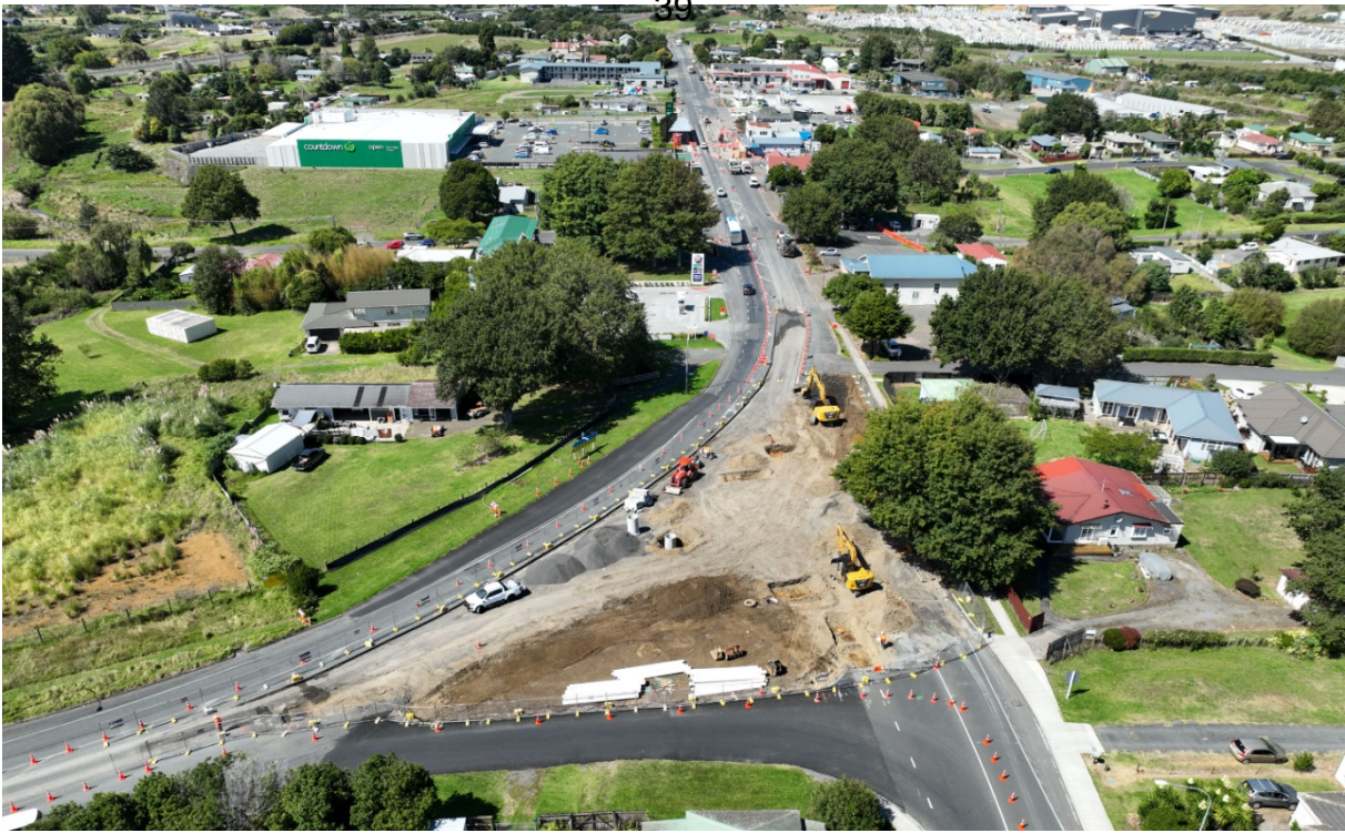
Great South Rd / Pokeno Intersection looking south