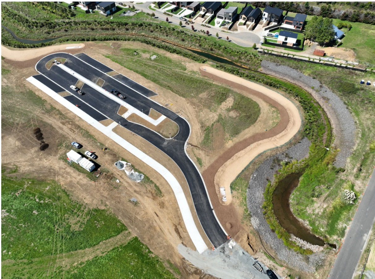
Pookeno Sports Park carpark

WDC are currently considering installation of bollards around the carpark to exclude vehicles from the fields, with works being undertaken whilst Munro Rd is closed.