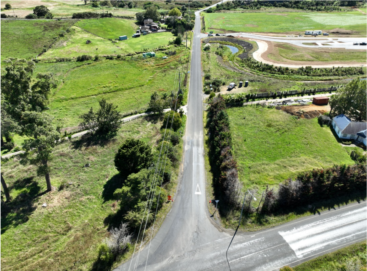
Munro Road looking north from Pokeno Rd

Physical Works to kick off on site in April, and the road will be closed to through traffic.