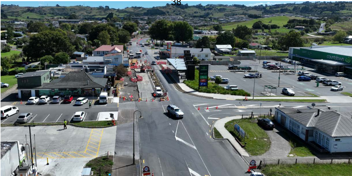
Main Street looking north