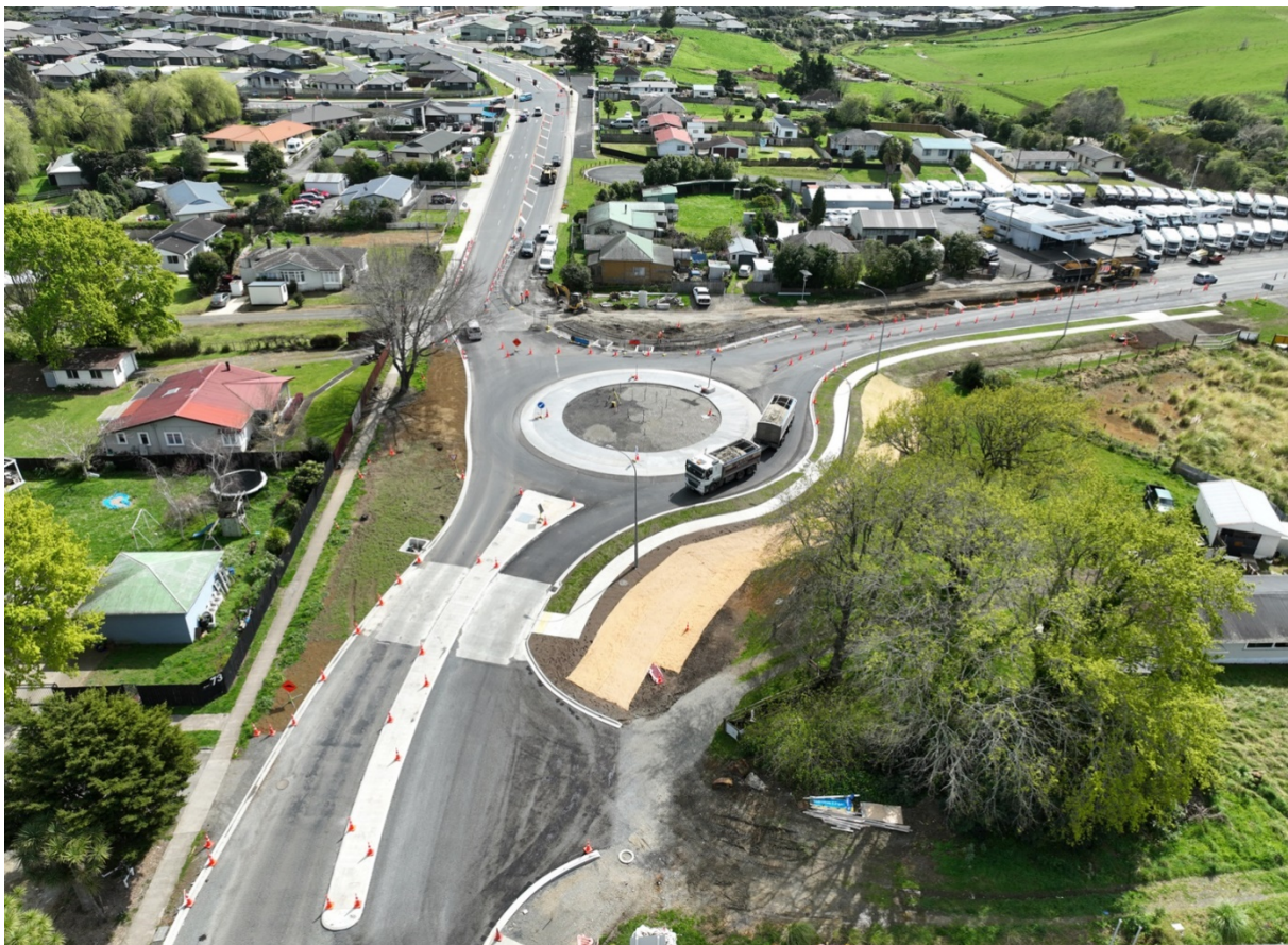
Roundabout site looking north

The asphalt surfacing and line has now been completed. This brings the new Pokeno Roundabout project nearer to completion. Planting and the removal of traffic control was due to be completed on 23 October. There are still some footpaths and driveways to finish off.