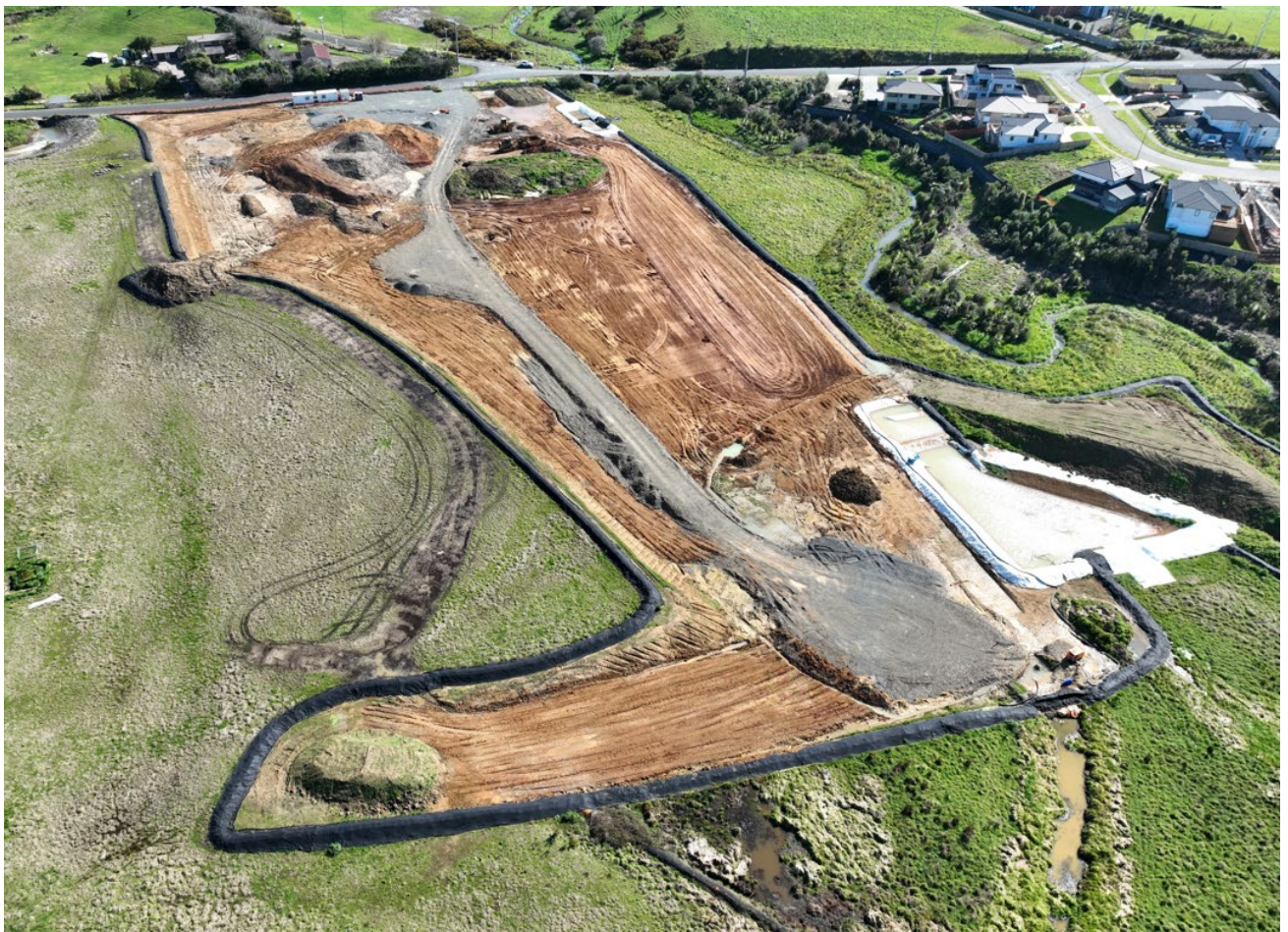
Pookeno Sports Park Earthworks

The carpark construction is subject to Waikato District Council Land Use Consent. We understand the granting of this consent to be imminent. Based on receipt of the consent the carpark works will commence this side of Christmas with completion scheduled for the end of February 2024.