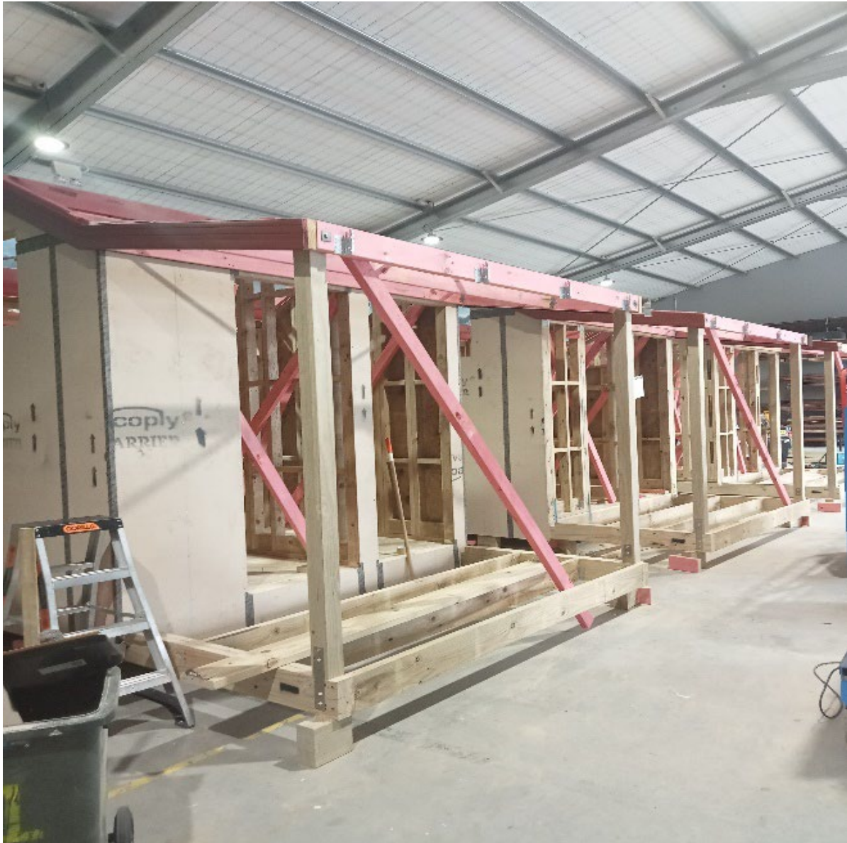
Toilet units being constructed in the Ngaruawahia factory.

The toilet manufacturing and installation contract was awarded to Modern Build Solutions, a local modular builder in Ngaruawaahia. Pookeno toilet detailed site-specific design has been finalised and submitted for Building Consent next week. Works are scheduled start mid-December.