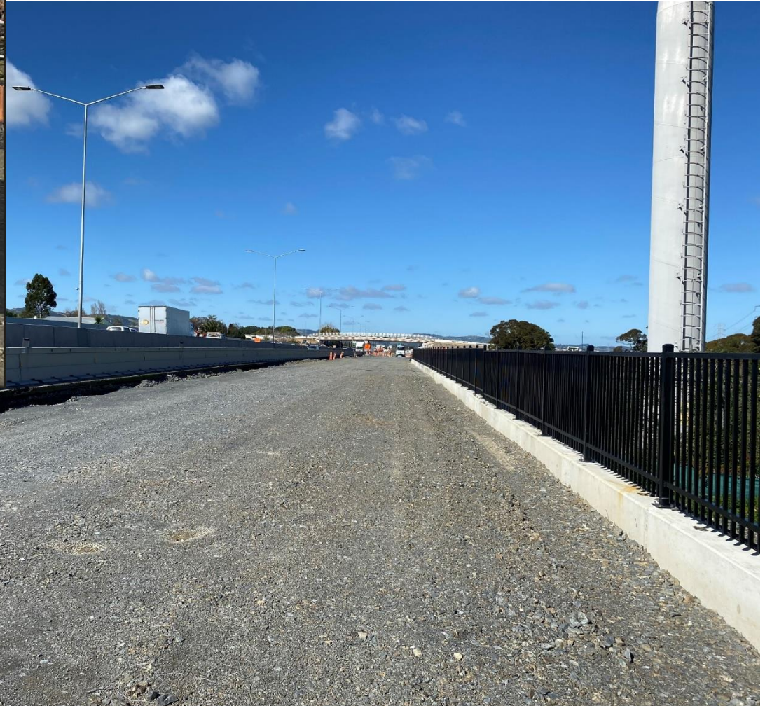
Northbound widening & box culverts