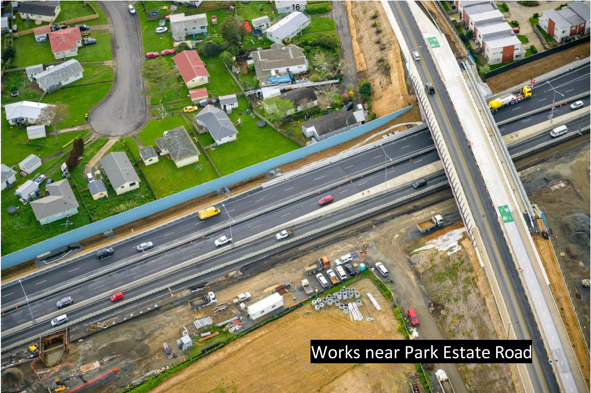
Works near Park Estate Road