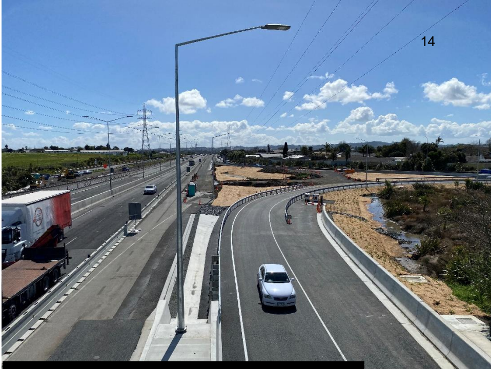
Southbound Loop On-ramp