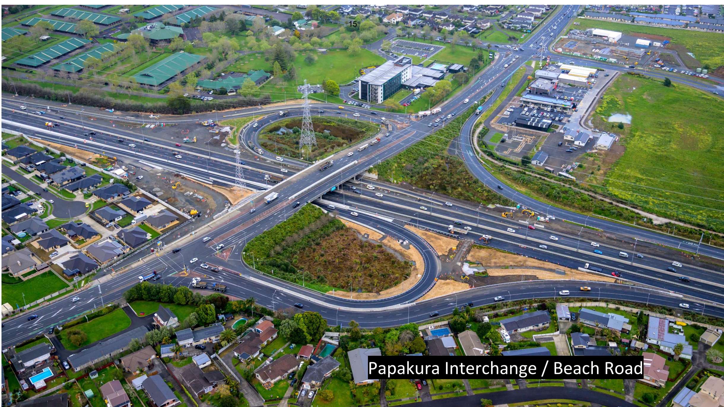
Papakura Interchange / Beach Road