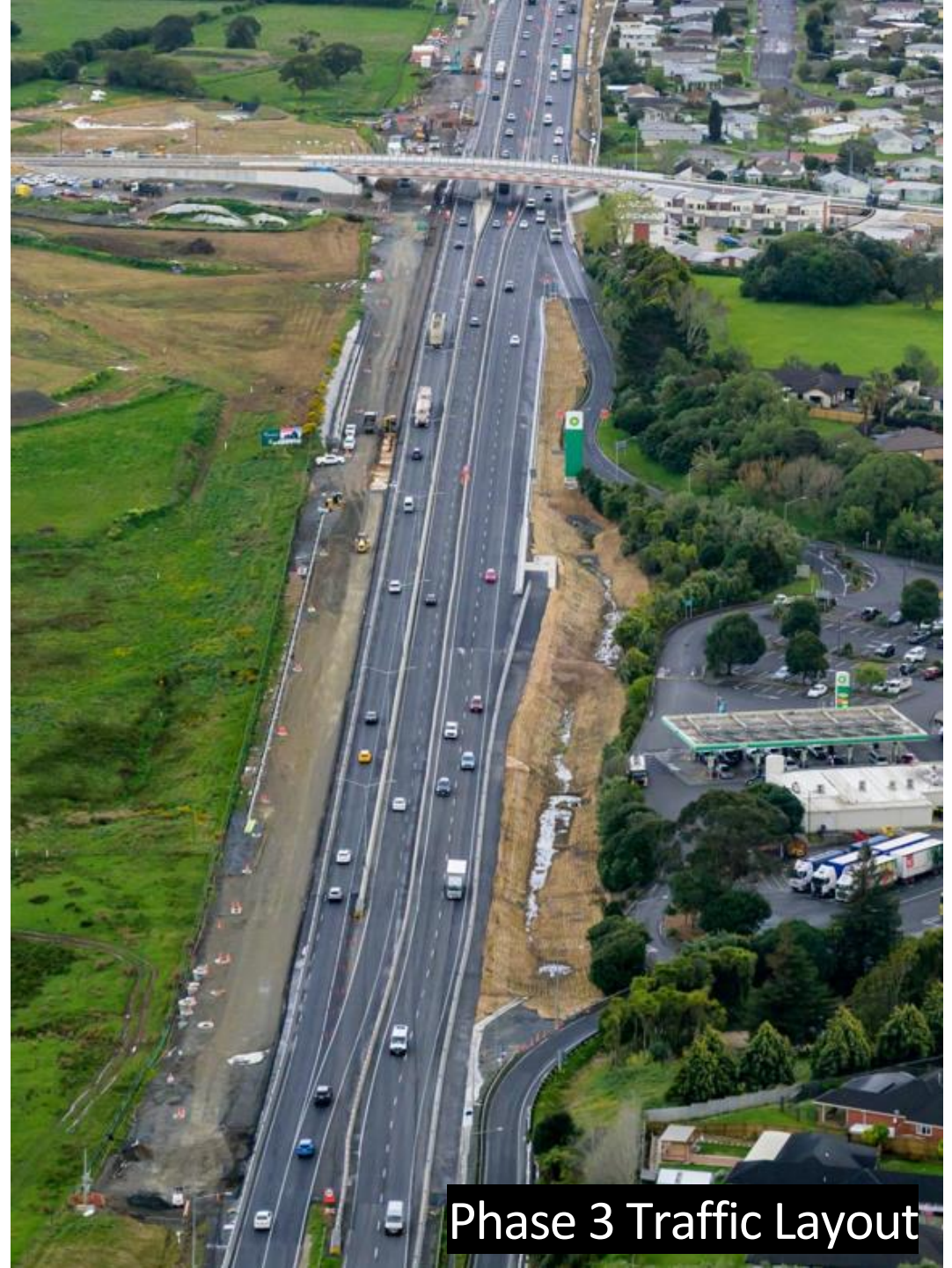
Phase 3 Traffic Layout