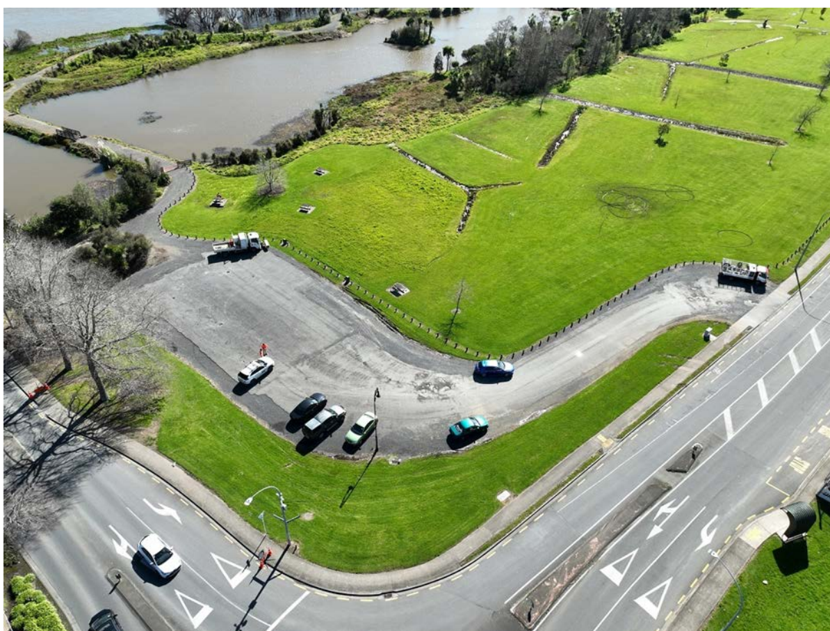
Tumate Mahuta Carpark

Physical works is scheduled for summer 2023.