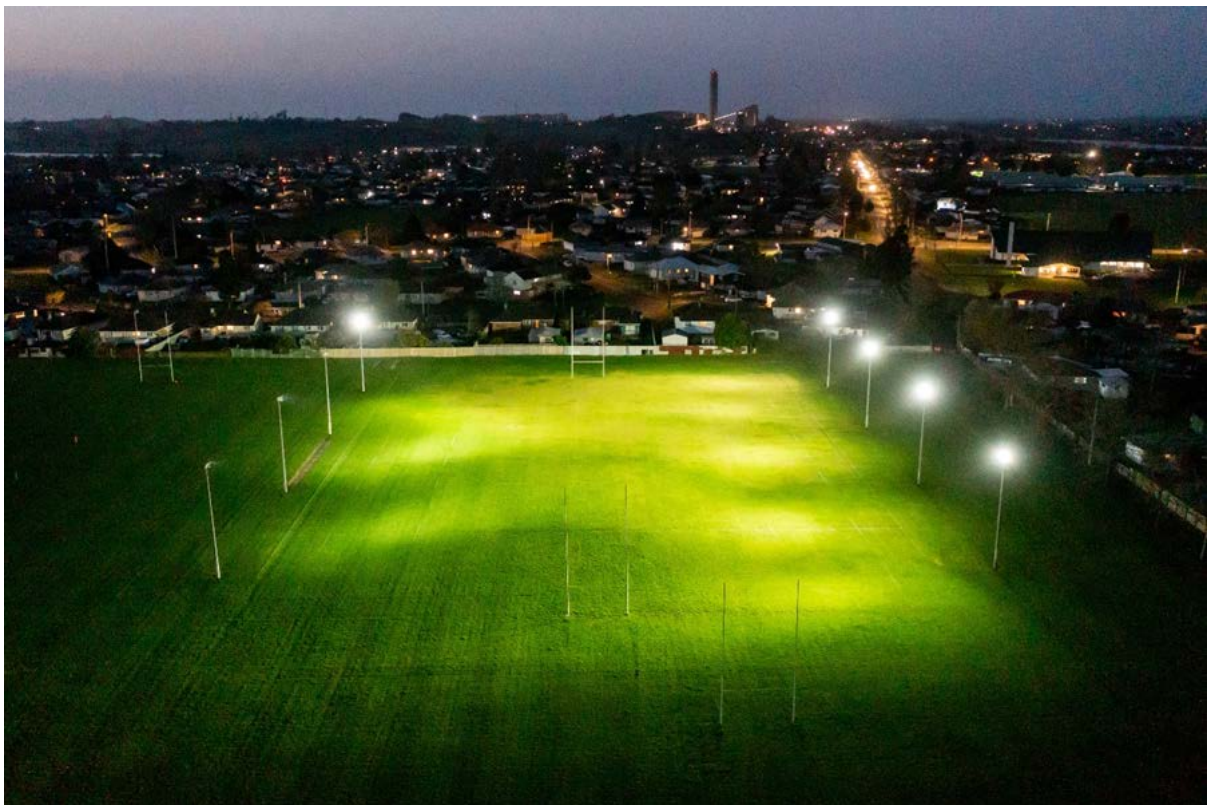
Current lighting looking south