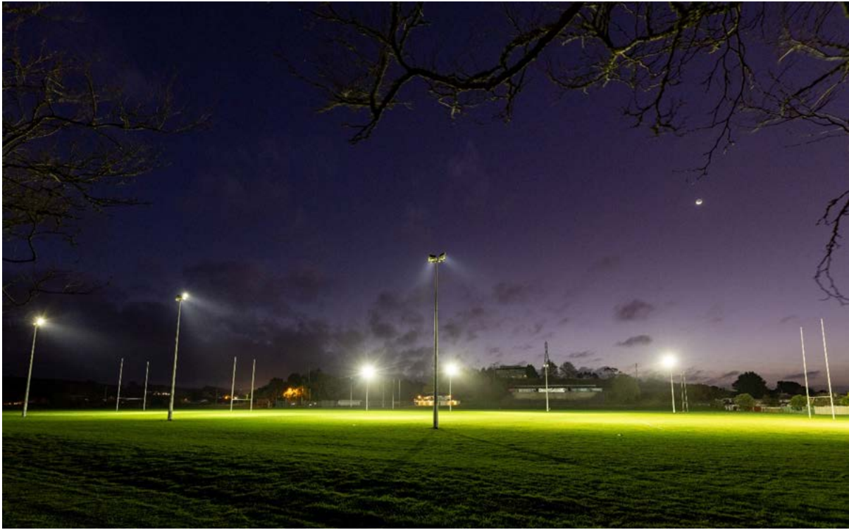
Current lighting looking west