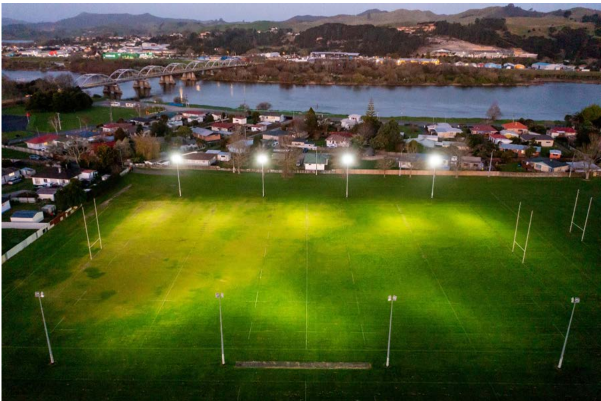
Current lighting looking east

The contract will start on 13 th November and is expected to last 3-4 weeks to replace the lights and install new pillar boxes.