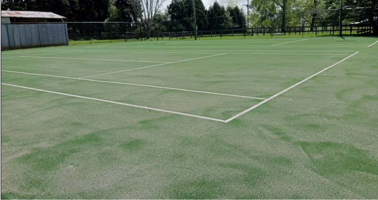
New courts surface