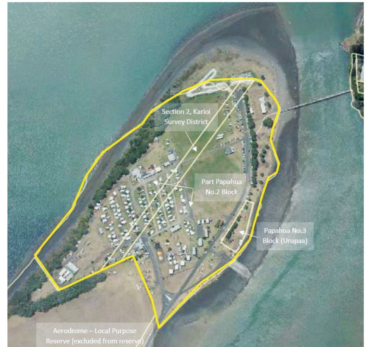
+ FIGURE 3: AERIAL VIEW OF PAPA HUA RECREATION RESERVE, IDENTIFYING LAND PARCELS

Waikato District Council GIS Aerial Image 2014