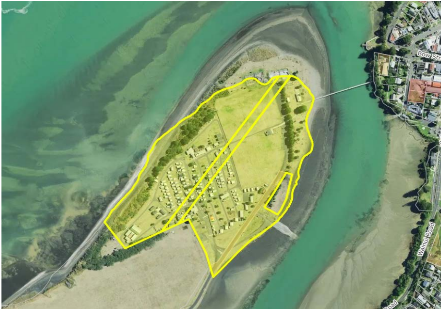
Papahua Recreation Reserve

The Papahua Recreation Reserve now comprises three land parcels and is legally described as Part Papahua 2 Block, Section 2 Block 1 Karioi SD and Part Papahua 2 (Roadway) Block.