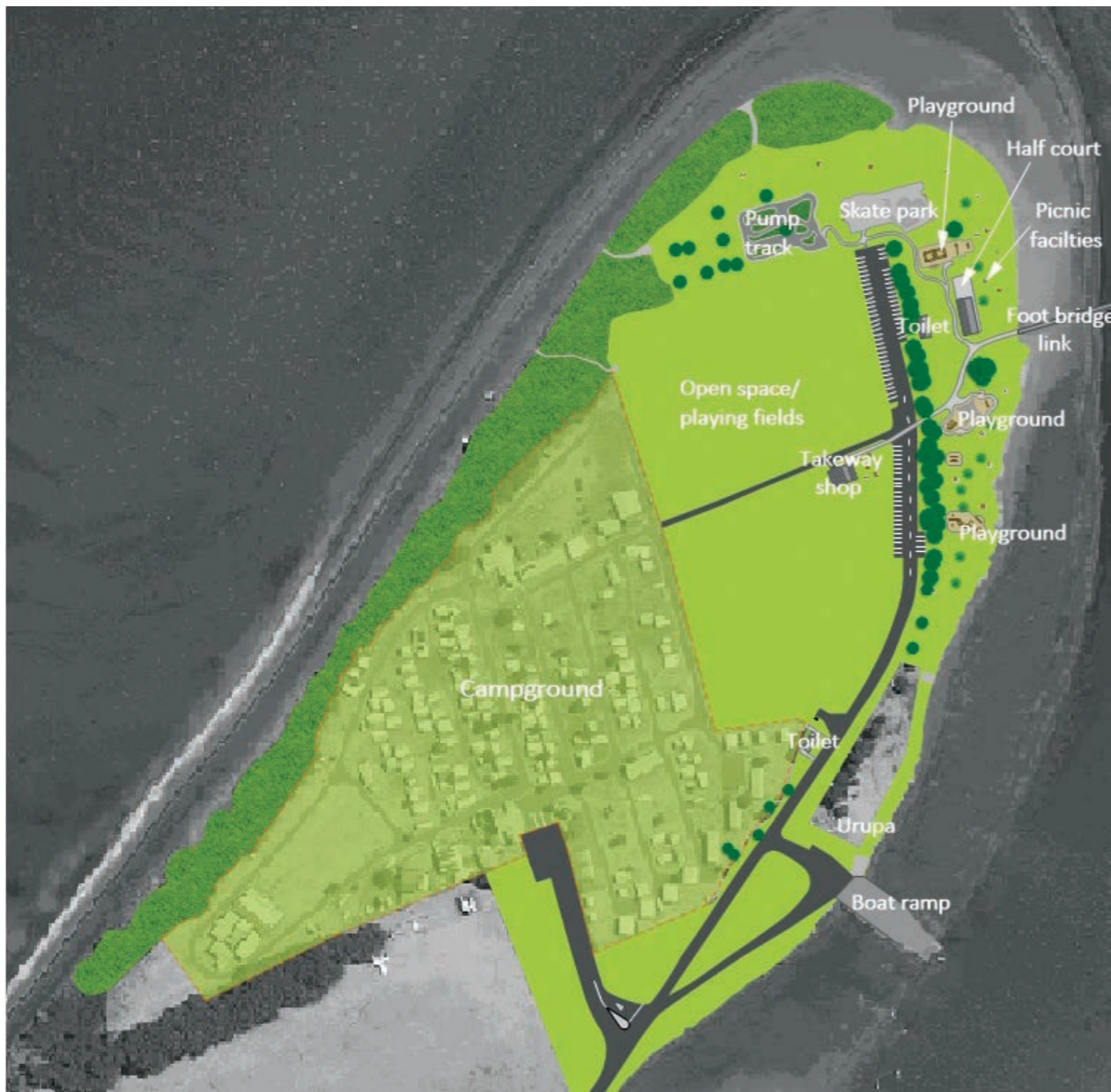
+ FIGURE 4: CAMPGROUND AND RECREATIONAL AREAS AND ASSOCIATED INFRASTRUCTURE ON PAPA HUA RECREATION RESERVE

Whilst the campground governance board is primarily responsible for the camping ground, it has undertaken joint development in the wider reserve including joint development of the BMX track and an exercise circuit. The public use of the campground area of Papahua Reserve, requires users to pay a daily fee for the use of a site and campground facilities.