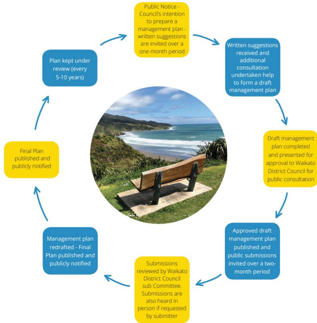
Figure 1: The process to create or review a Reserve Management Plan, in accordance to the Reserves Act 1977