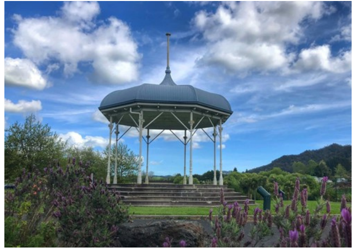
The Point, Ngāruawāhia