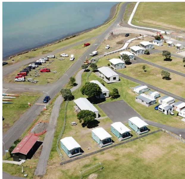
Papahua Path progressing

The concrete path east of the campground entranceway is starting in sections. Community Connections are continuing conversations with the Football Club. Campground are to provide scope of fence requirements. Targeting completion of path and entranceway on 3 December.