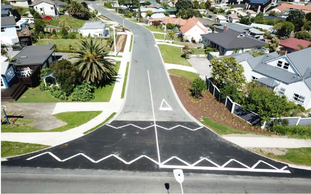
Looking south along Gilmour Street

Final tidy up tasks to be done to complete the works.