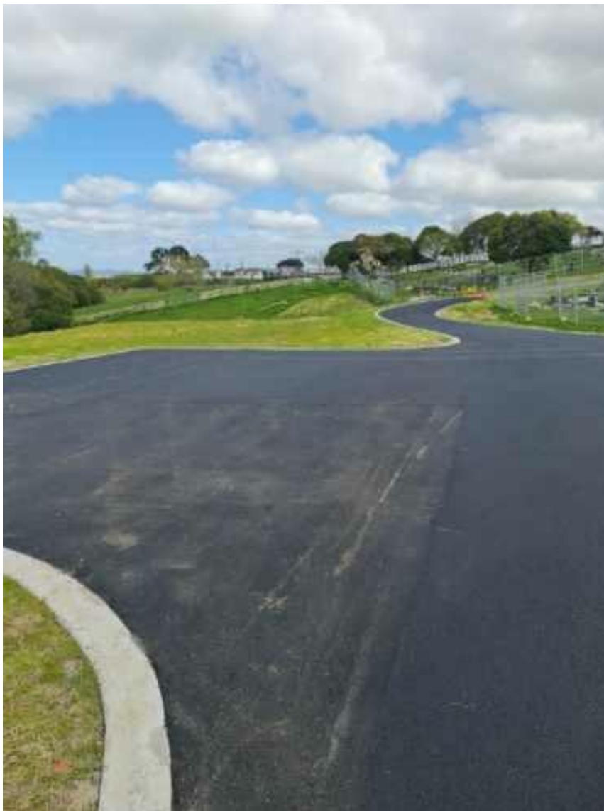
Newly asphalted surface at Rangiriri Cemetery.

The footpath has been poured and the asphalt has been laid for the driveway. Tire stoppers will be installed next week with the aim to have all works completed by beginning of November.