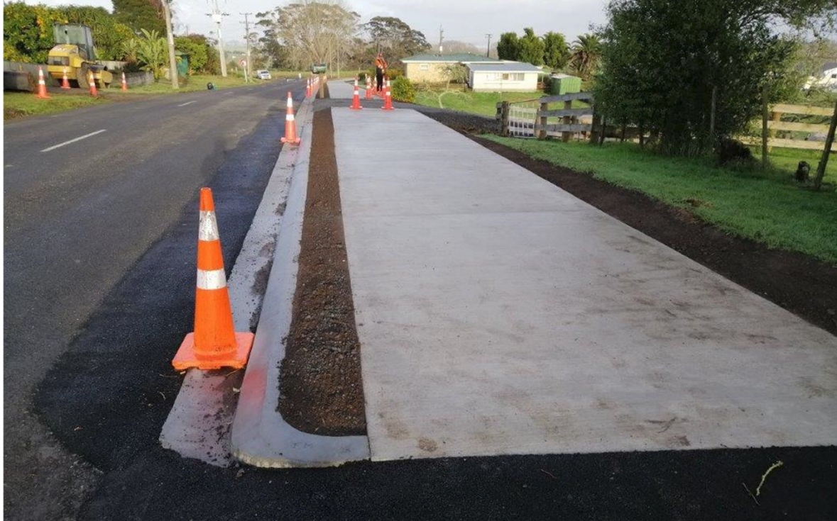
New concrete path on Travers Road looking towards Wayside Rd intersection

Completing reinstatement works and finishing off the entranceways. This will complete this phase of the project.