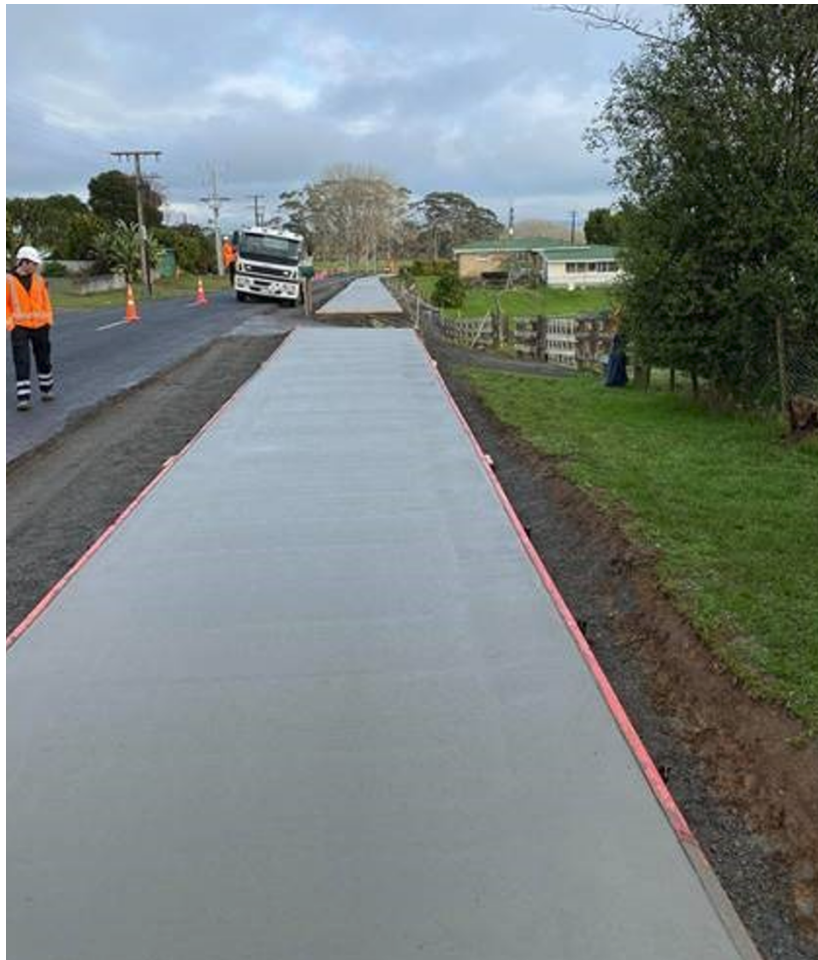
New concrete path on Travers Road looking towards Wayside Rd intersection

Some delay has occurred around issues getting the WEL power joint box relocated and Watercare to raise the meter box and lateral pipe to enable the driveway to be raised and asphalted.