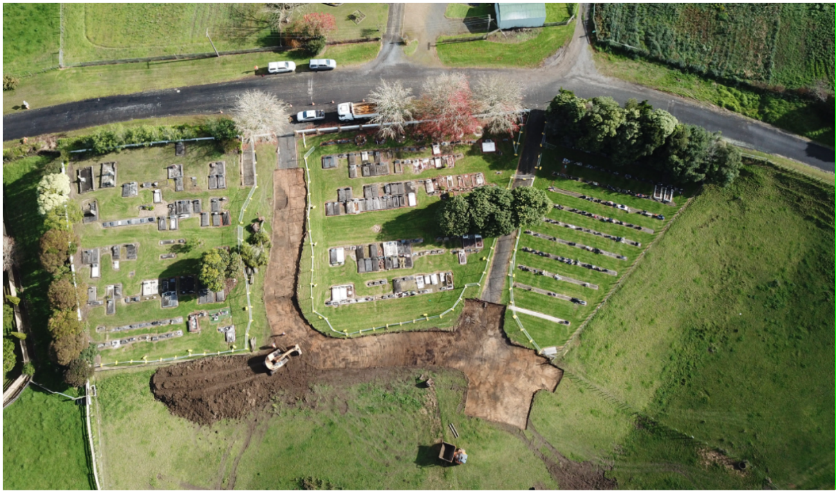
Aerial shot of the cemetery showing the work site area.

The subbase material is continuing to be constructed as is prepping for the concrete kerbing.