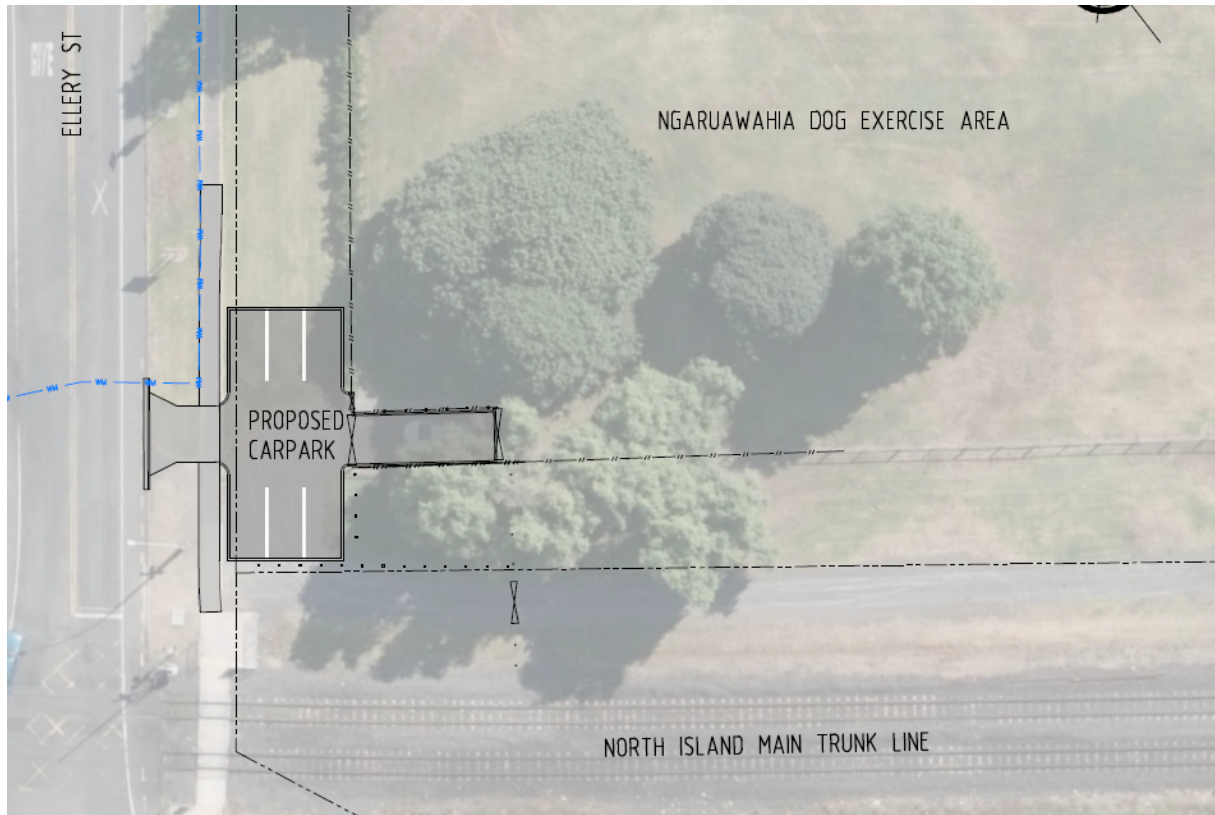
Ngaruawahia Dog Park Carpark.

Preparing temporary traffic plan for approval – some complexity with the adjacent railway line.