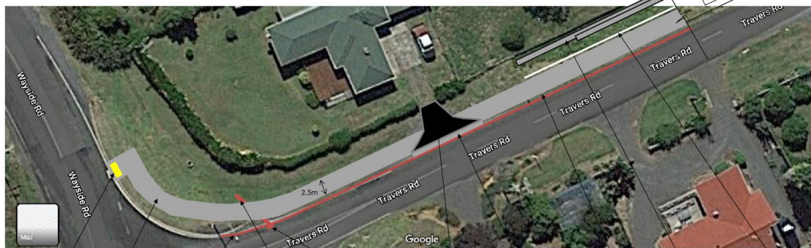
LAYOUT PLAN 001